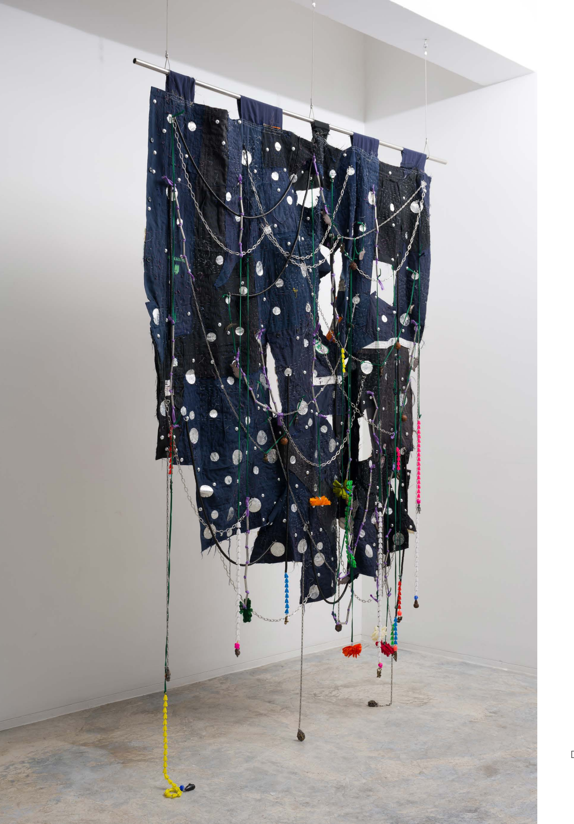
HC20, 2023 Deconstructed uniforms, metal talismanic objects, plastic beads & artificial Marigold flowers 153 x 150 cm 60 1/4 x 59 in