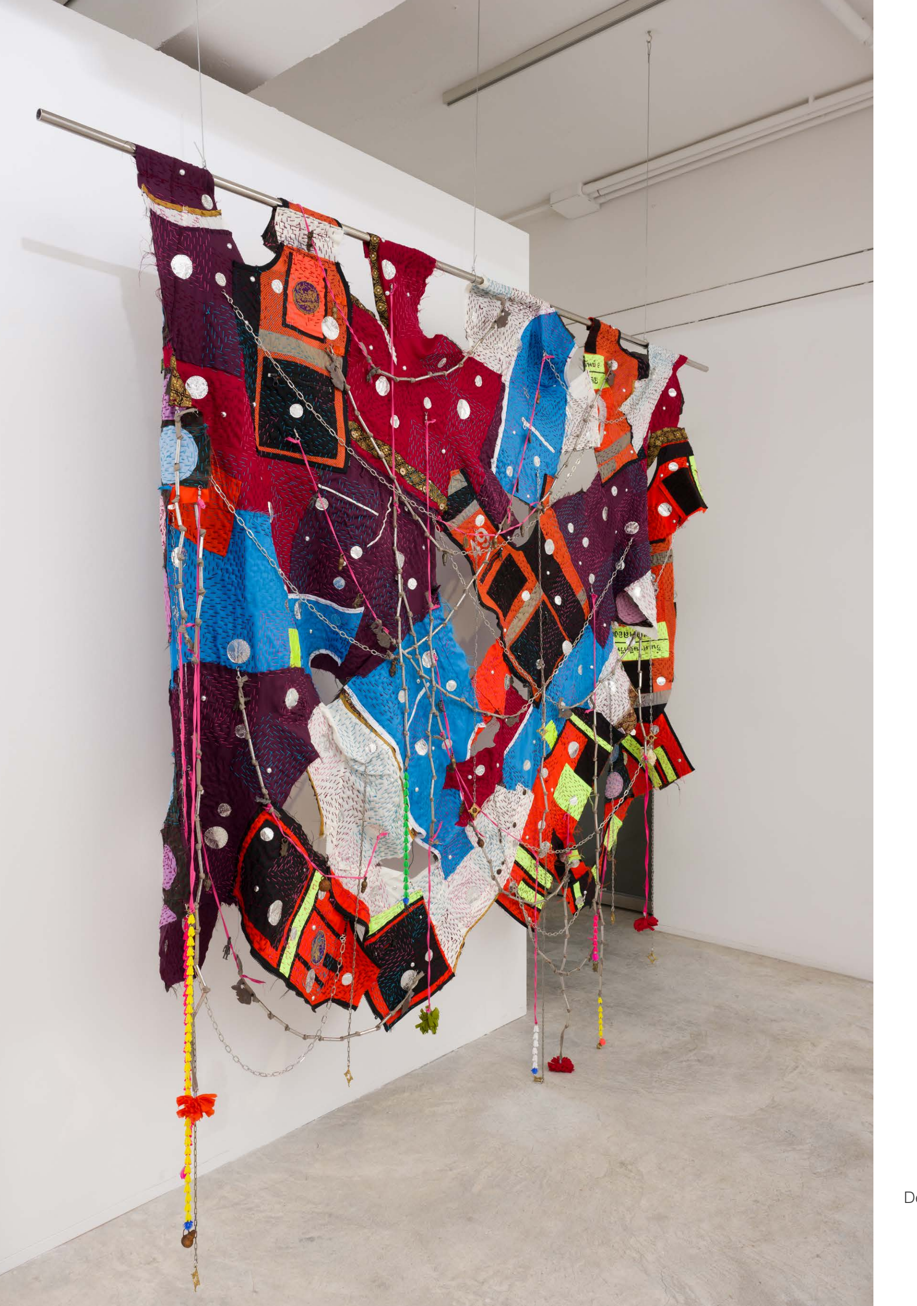
CG20, 2023 Deconstructed uniforms, metal talismanic objects, plastic beads & artificial Marigold flowers 210 x 183 cm 82 5/8 x 72 in