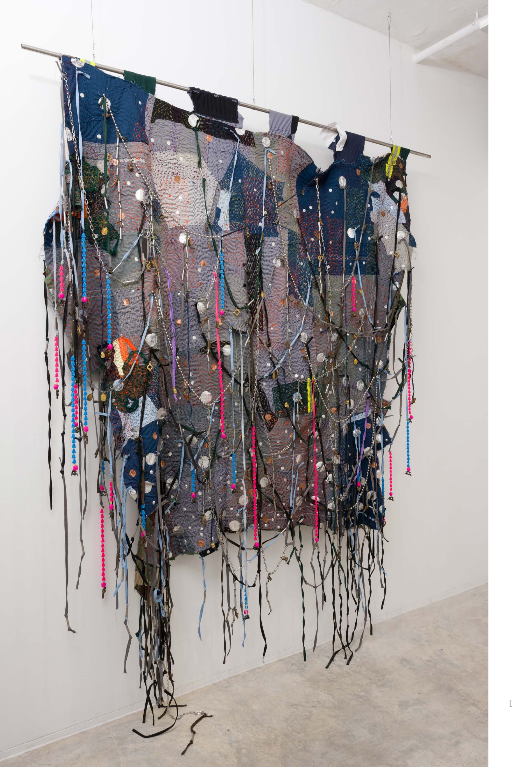
MM20, 2023 Deconstructed uniforms, metal talismanic objects, plastic beads & artificial Marigold flowers 170 x 200 cm 66 7/8 x 78 3/4 in