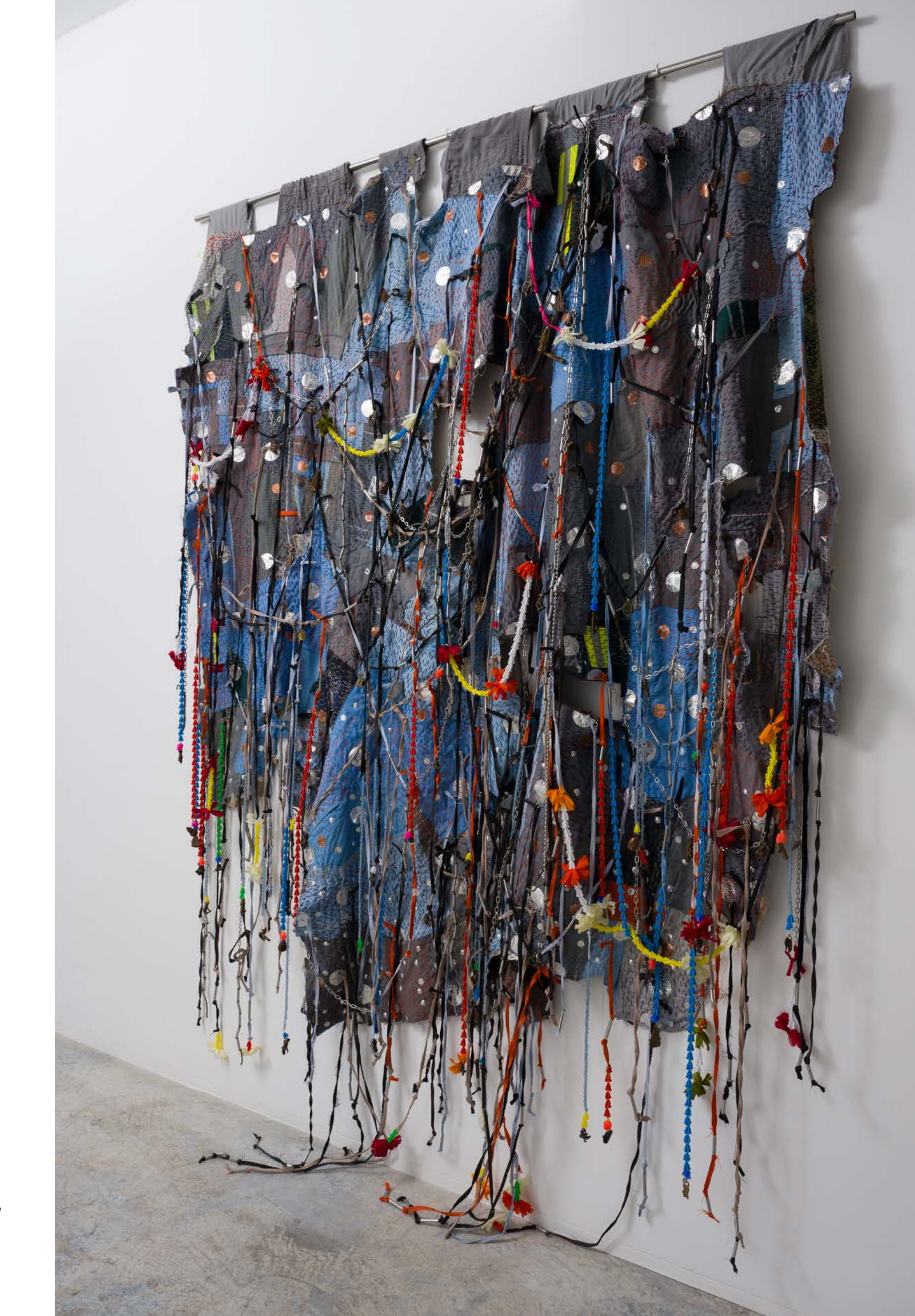
LD20, 2023 Deconstructed uniforms, metal talismanic objects, plastic beads & artificial Marigold flowers 214 x 200 cm 84 1/4 x 78 3/4 in