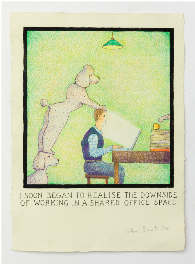
Glen Baxter, I Soon Began to Realise the Downside of Working in a Shared Office Space , 2021, Ink and crayon on paper, 79 x 58 cm.