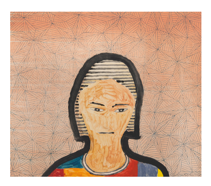
Stephen Chambers, Russian in Venice I , 2005, Monotype, 35 x 40.5 cm, 14 x 16 in

info@flowersgallery.com www.flowersgallery.com