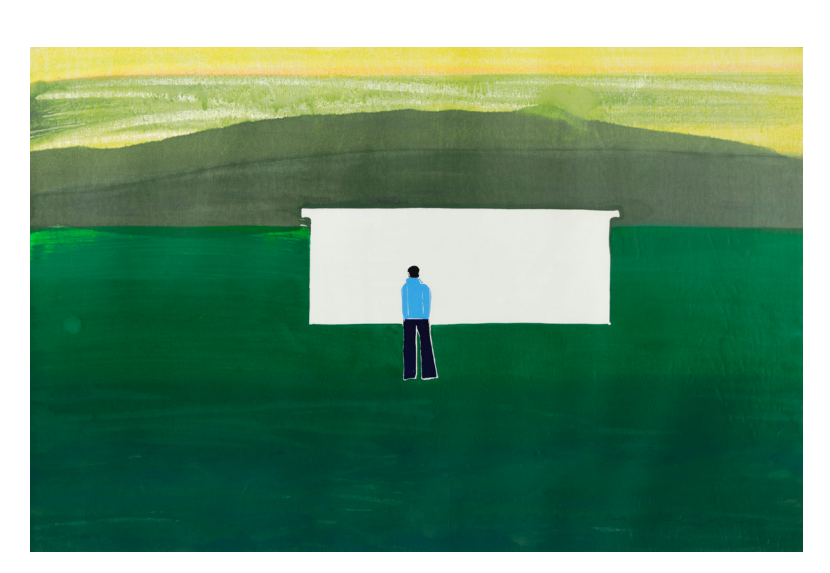
Tom Hammick, Tank, 2013, Monotype, 80 x 120 cm, 31 1/2 x 47 1/4 in