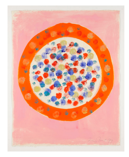
Terry Frost, April One , 1999, Monoprint, 122 x 96 cm, 48 1/4 x 38 in