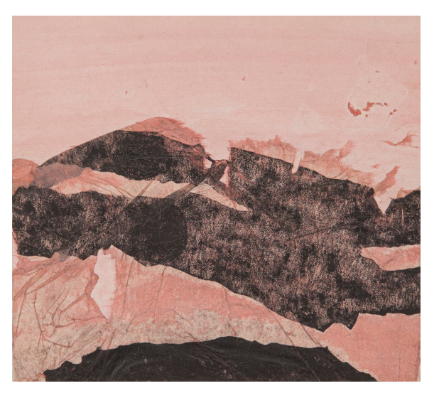
Prunella Clough, Seabed, Monotype and collage, 15.4 \times 17 cm, 6\ 1/4 \times 6\ 3/4 in