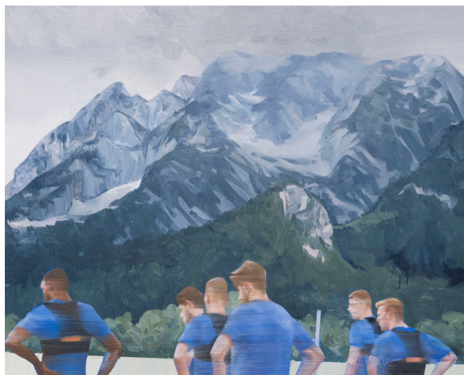
Captions clockwise from top left: Country Pursuits , 2019, oil on canvas, 122 x 122 cm; No Man Left Behind , 2019, oil on canvas, 90 x 141 cm; Under the Mountain , 2018, oil on canvas, 81 x 100 cm; Wanderer Before a Sea of Fog , 2019, oil on canvas, 97 x 102 cm