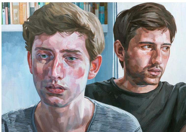
Brothers , 2019, oil on canvas, 140 x 200 cm

Taking its title from Ernest Hemingway's 1927 volume of short stories about bullfighting, boxing and embattled relationships, Men Without Women comprises a series of portraits and narrative scenes depicting the male figure in conflicting emotional and physical states. Drawing out themes of loneliness and camaraderie, violence and vulnerability, Schierenberg's cast of sports heroes, fathers and brothers, 'lads' drinking on the town and solitary figures provide a nuanced reflection on current debates surrounding masculine stereotypes.