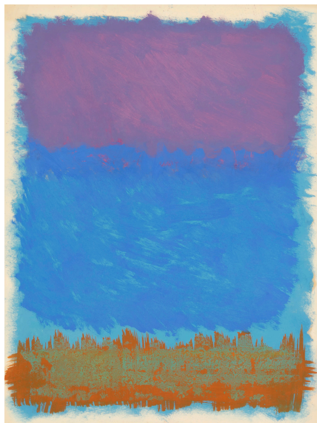
Homage to Rothko', 1956, Oil and gouache on Paper, 50.8 x 38.2 cm