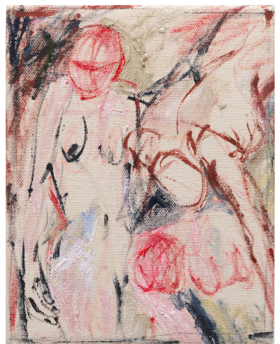
Kim Booker, Tempest, 2023, Oil, graphite and charcoal on canvas, 20 x 15cm