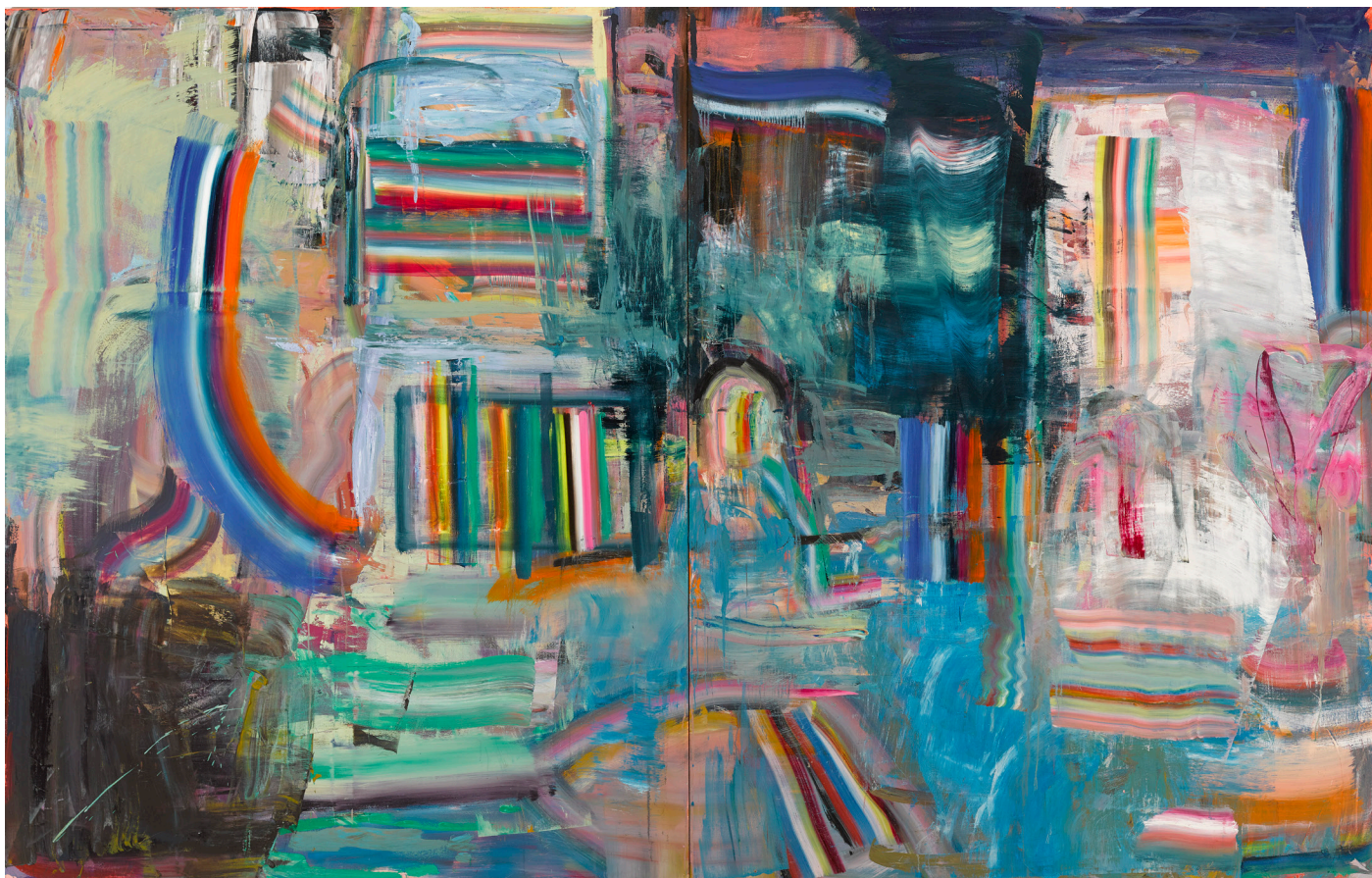
Neural , 2023, oil on canvas, 223 x 335cm