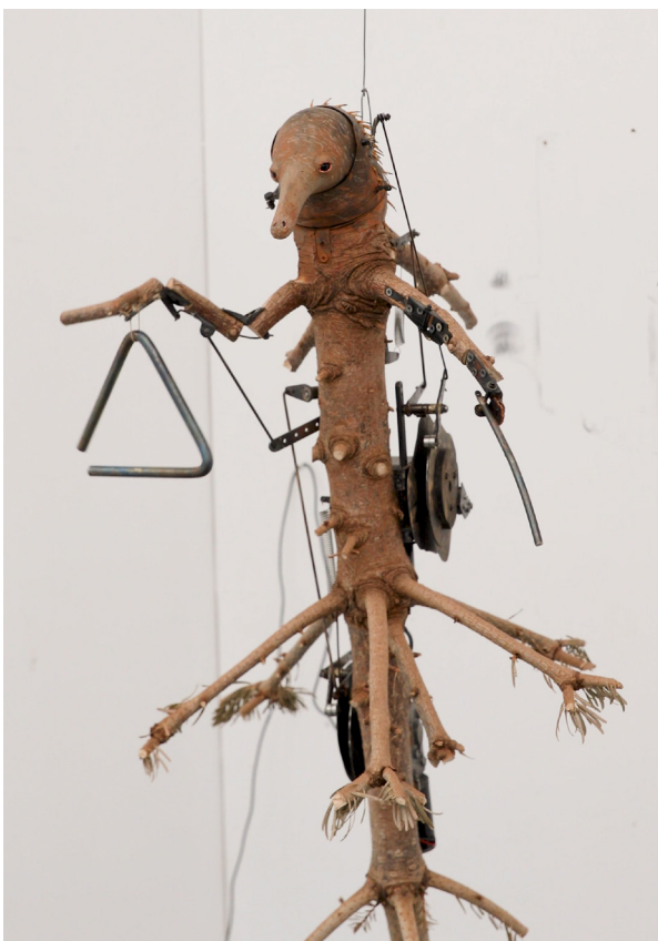
Images from top left: Serpent (details), 2023, steel, fibreglass, electric motor; The Forest Visits (detail), 2023, steel, found tree, plastic, electric motors