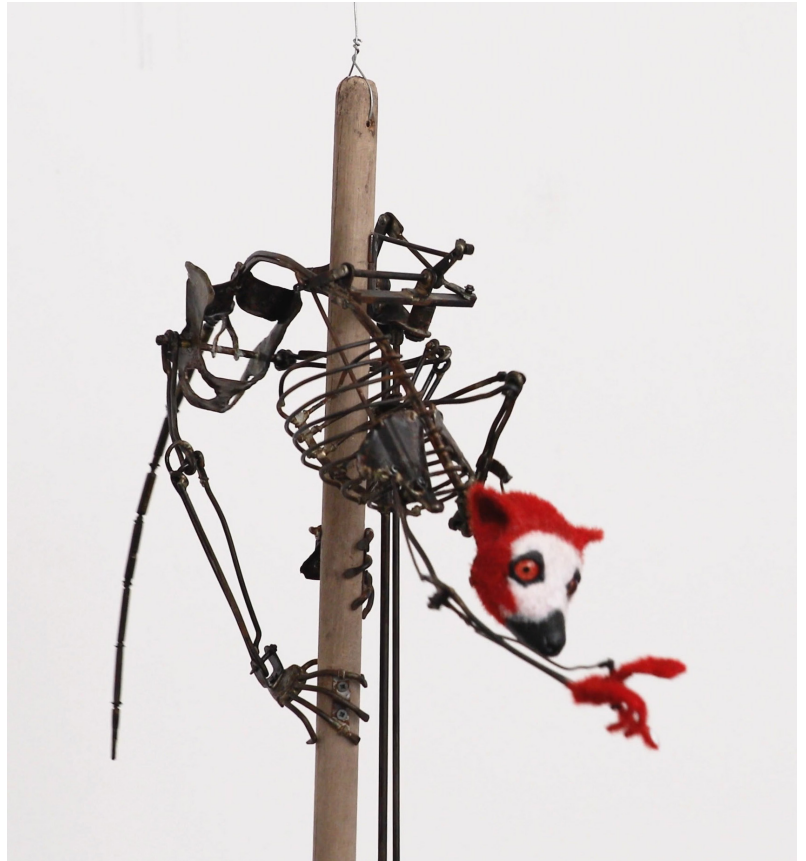
Tim Lewis, Die Hacke (detail) , 2022, steel, wood, industrial flocking, electric motor, 188 x 52 x 35 cm

Lewis's works are often inspired by science fiction, including writers such as Philip K. Dick or Stanislaw Lem, and the works themselves are frequently suggestive of speculative futures. In this exhibition, Lewis also looks to the present landscape, referring to footage from the depths of the ocean in a new work titled Sargasso Sea Floor . In this work, Lewis draws on the current realities of ocean beds strewn with human-generated plastics, while also reflecting the continual resourcefulness and adaptation of the natural world to environmental change.