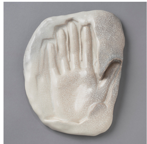
Clockwise from top left: Julie Cockburn, Boat Race 6 , 2022, Hand embroidery and self adhesive vinyl on found photograph, 18.4 cm x 10.3cm; Jennifer McRae, Angel , 2022, oil on linen paper, 18 x 13 cm; Carol Robertson, Madrigal #2 , 2022, oil on board, 12.5 x 17.8 cm; Glenys Barton, Imprint II , 2017, ceramic, 20.5 x 16 x 5 cm; Mark Duffy, Untitled No.12 (On Pugin) , photographic print, 18 x 23 cm