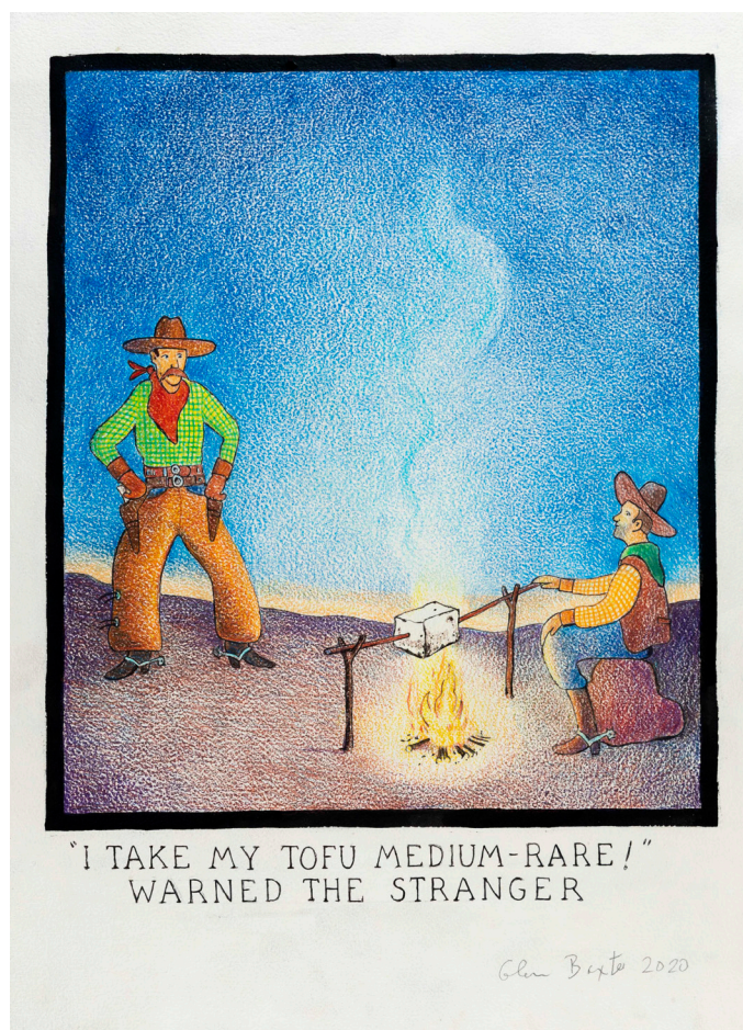
"I Take My Tofu Medium Rare!" Warned the Stranger, 2020, ink and crayon on paper, 79 x 58 cm