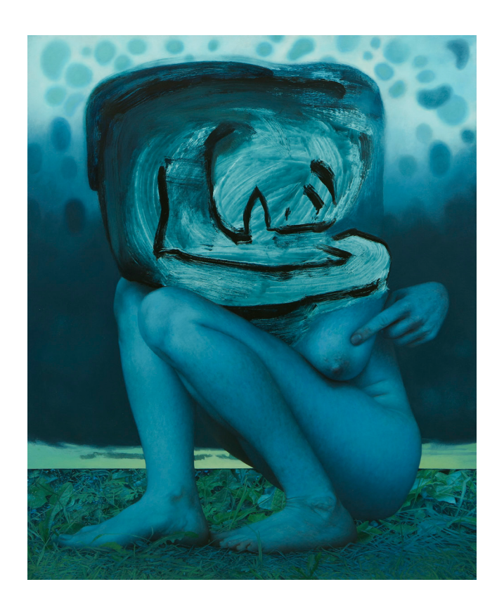
From left: The Opening, oil on canvas, 121.9 x 101.6 cm; The Prodding, oil on canvas, 121.9 x 101.6 cm