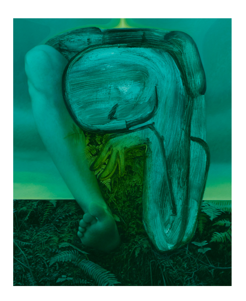
The Unearthing, 2021, oil on canvas, 121.9 x 101.6 cm

Fluctuating between imposing rational structures and allowing the paintings to follow their own course, Chapin's new works remain fluid throughout their making, and open to chance. As the title of the exhibition Walking Backwards suggests, each painting treads a pathway into the unknown, shedding the