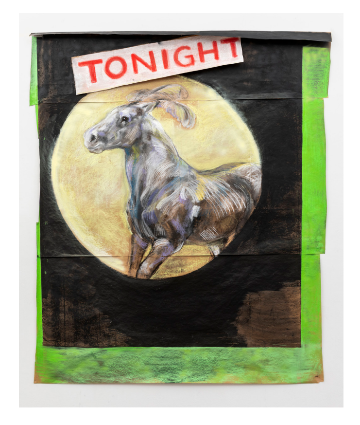
From top left: Keep Up, 2021, charcoal on paper, 280 x 240 cm; Keep Up, Get Up, 2020, charcoal on paper, 281 x 267 cm; NOW, 2021, charcoal on paper, 195 x 156 cm; Spotlight Horse, 2021, charcoal on paper, 240 x 203 cm

All images (C) Nicola Hicks, courtesy of Flowers Gallery