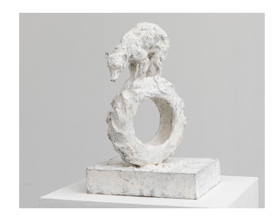
Miniature Bear from Dump, 2019, bronze, 24 x 17 x 20 cm

Upturning the anthropocentric perspective of the circus act, the animals appear to be adapting to the urban habitat on their own terms. Appropriating discarded human objects, and balancing precariously on pallets, a fridge and gigantic rubber tyres, their triumphant gestures amongst the remains of the city reflect both a horrifying account of human havoc on the planet and hopeful speculation on the irrepressible endurance of the natural world.