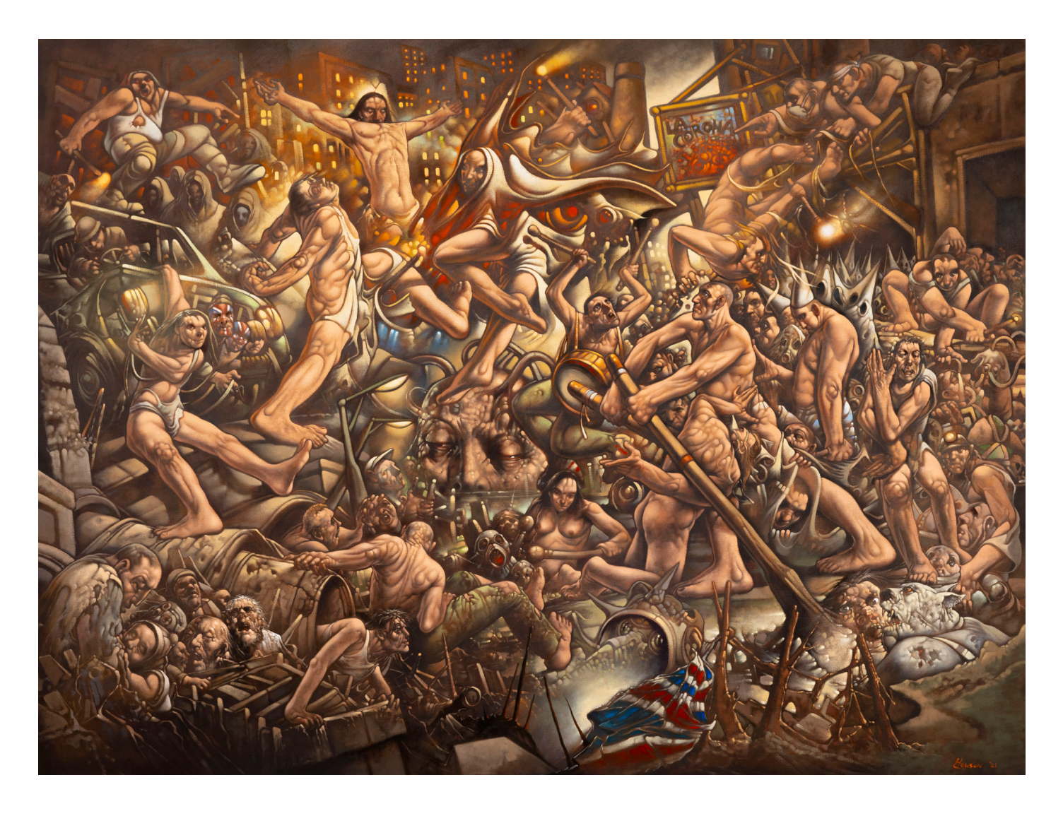
Phlegethon (The Fiery Third River of Hell), 2021 oil on canvas, 153 x 183 cm