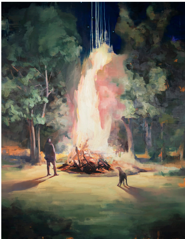
Ancient Ritual , 2021, oil on canvas, 180 x 140 cm

The Past is Another Country depicts a fleeting, shifting landscape as seen through the windows of a car. The vehicle is a recurring motif in Schierenberg's paintings, relating to the artist's peripatetic early childhood spent on the road traversing the landscapes of Europe and North Africa. The fluid experience of movement here suggests the passage and cycle of time continuing throughout the generations, a theme that is also strongly reflected in the lunar tide of Old Moon . By equating the rhythms of nature with what he terms the 'seasons' of human experience, Schierenberg raises the question: "when we turn to nature, do we do so to understand and find ourselves?"