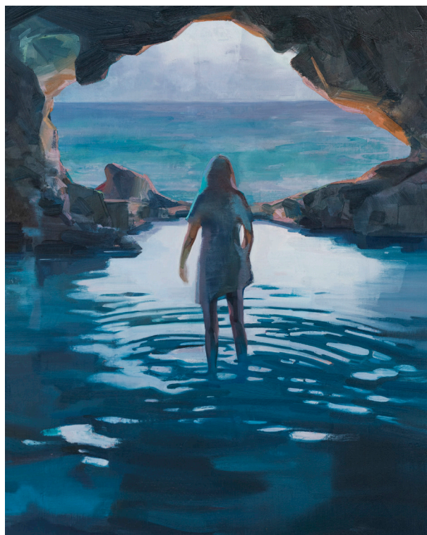
Bodies of Water , 2021, oil on canvas, 100 x 80 cm

All images (c) Tai Shan Schierenberg, courtesy of Flowers Gallery.