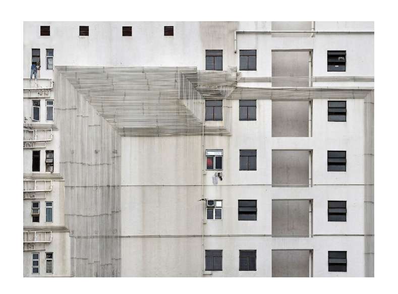
Industrial #26, 2015, Chromogenic Print, 177 x 251 cm

press@flowersgallery.com www.flowersgallery.com