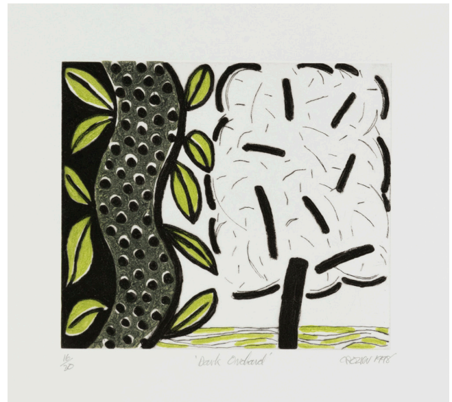
Clockwise from top left: Garden , 1998, carborundum, 63 x 69 cm; Venetian Bouquet , 2008, coloured aquatint, hand finished; 61 x 75 cm; Cafe , late 1990s, carborundum, 76 x 80.5 cm; Dark Orchard , 1998, 44.5 x 44.5 cm