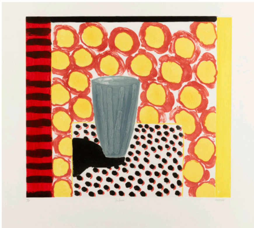
Interior , Late 1990s, Carborundum, 75 x 79 cm