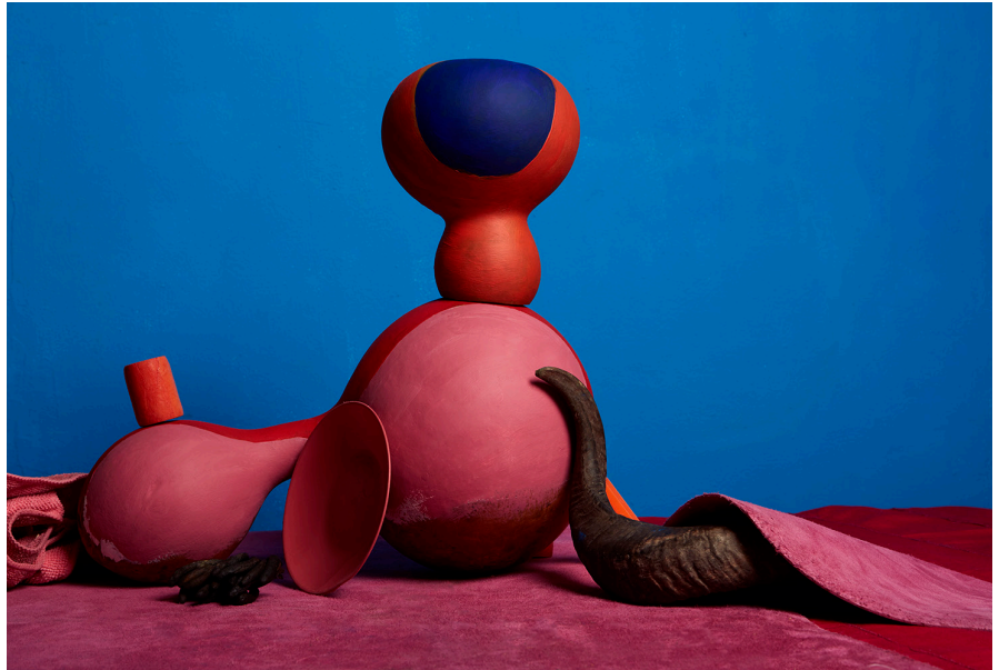
Painted Agbe, Italian Leather, Coral Beads and Horn, from the series Money Must Be Made.