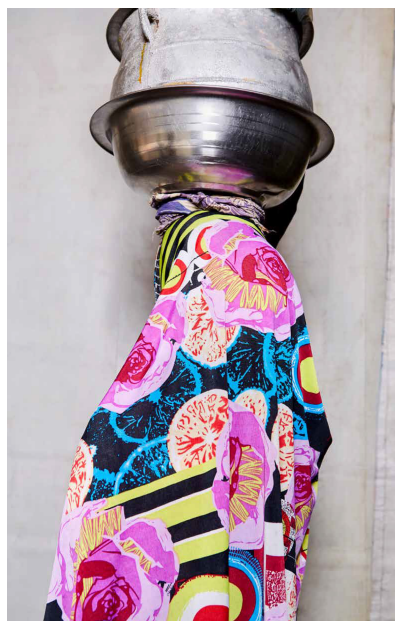
All images from the series Money Must Be Made , (c) Lorenzo Vitturi, courtesy of Flowers Gallery.

Opening Hours: Tuesday - Saturday 10am - 6pm.