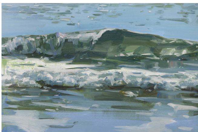
Green Wave , 2016, Oil on Canvas, 60.5cm x 91cm