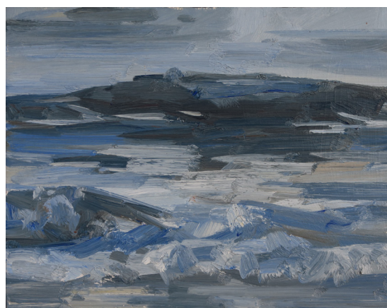
Black Wave , 2016, Oil on board, 28cm x 35.5 cm