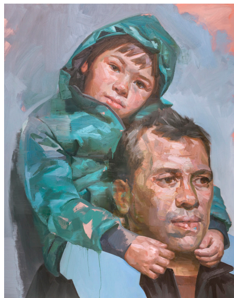
Brother and Child , 2016, Oil on canvas, 153cm x 122.5cm