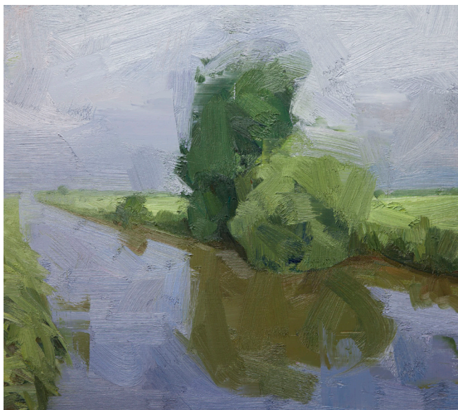
Canal Summer Morning , 2016, Oil on Canvas, 45 x 50 cm