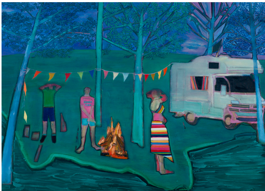
Walden Pond , 2019, oil on canvas, 138 x 199 cm

On view at Flowers Gallery will be a solo presentation of new paintings connected to both poetry and music, first developed during a residency at the 71st Aldeburgh Festival. Incorporating themes assembled from literary as well as musical sources, the subject matter of Hammick's paintings shifts fluidly between the biographical and poetic.