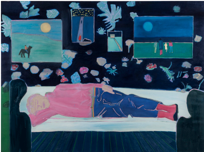
Clockwise from top left: Henry's Cabin, Walden Pond 1 , 2018 Oil on canvas, Campfire Study , 2019, oil on canvas, 38 x 45.5cm 138 x 199 cm; Poet Dreaming , 2018, oil on canvas, 141 x 191 cm