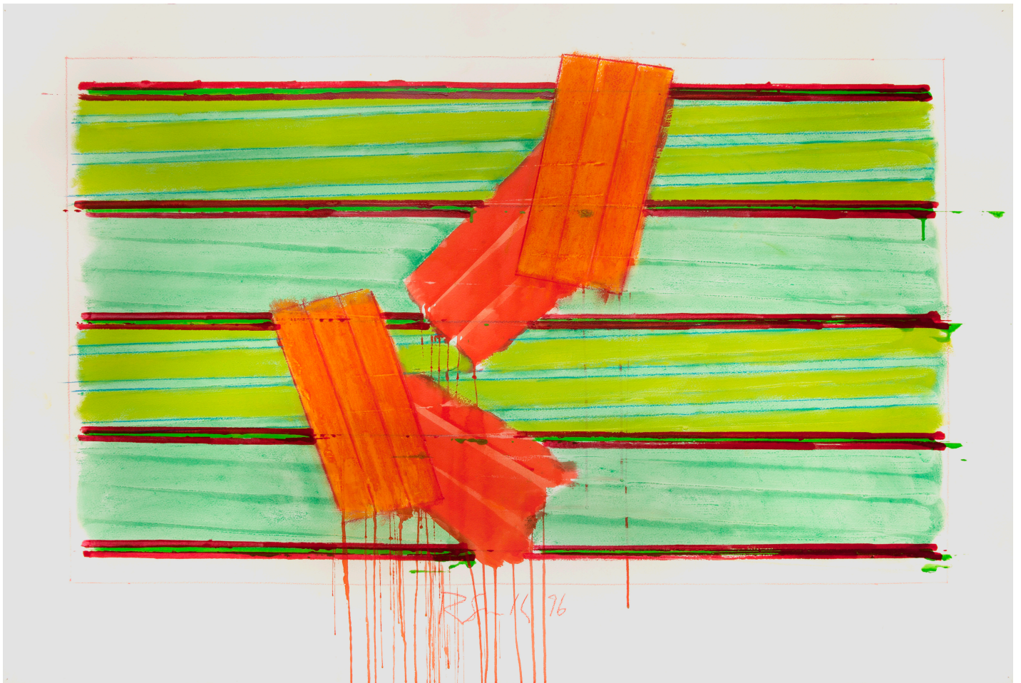
Untitled I (Orange Squares) , 1996, Acrylic and mixed media on paper, 76 x 112 cm, 30 x 44 1/4 in

INFO@FLOWERSGALLERY.COM WWW.FLOWERSGALLERY.COM