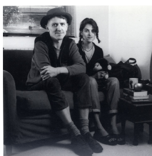
1998: Billy Childish chosen by Tracey Emin