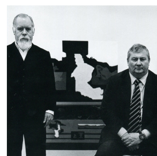
1991: Terence Donovan chosen by Peter Blake