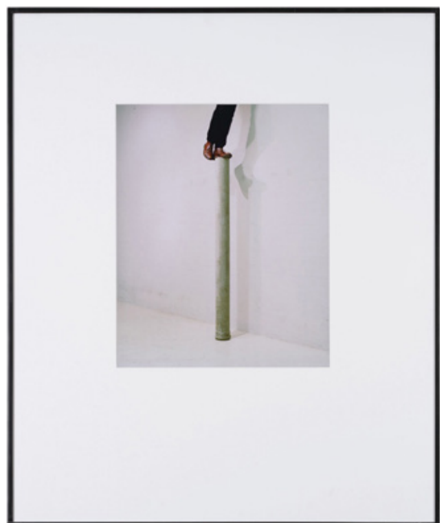
In Preparation No.09 , 2012