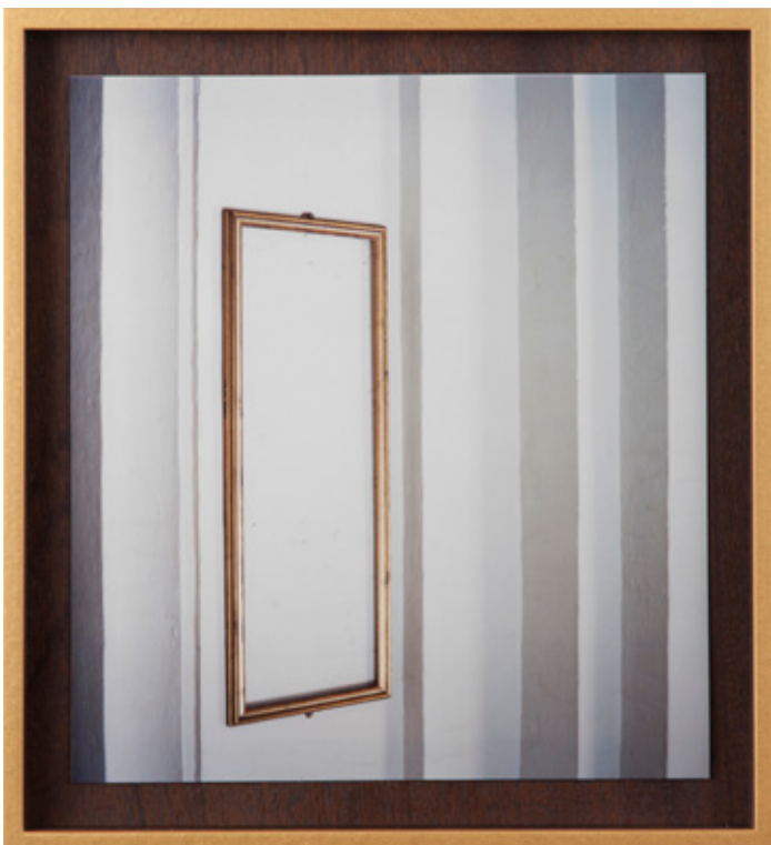
Rosso Teatro , 2012