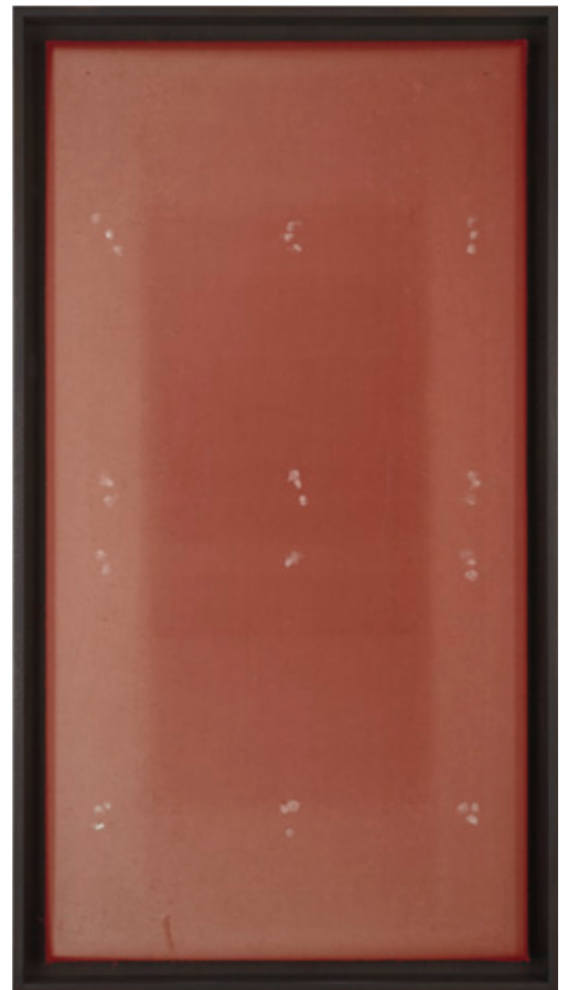
Untitled Red , date unknown - 2014