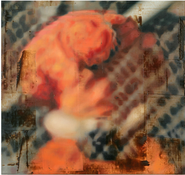
Submission I , 2005, Oil on linen, 86.5 x 92 cm / 34 x 36 1/4 in