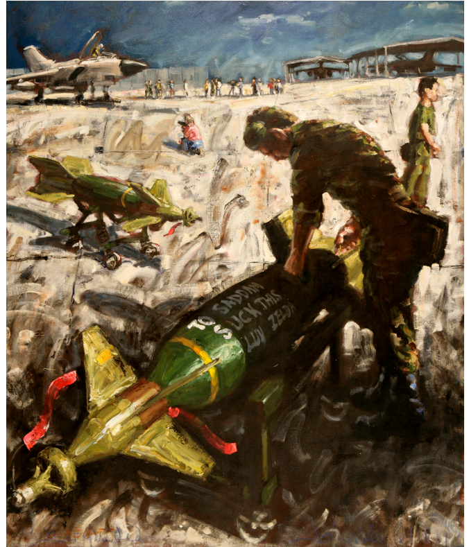
Laser Guided , 1991, Oil on canvas, 210 x 173 cm / 82 3/4 x 68 in

The recurrence of the suit in new works such as Kneel , Jump and Distillation of Terror , this time with reference to recent events in the Middle East, suggests both an enduring cycle of conflict, and Keane's prescience in selecting subject matter that has gone on to perpetually haunt the headlines.