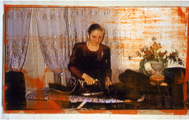
Untitled (Terrorist) 3 , 2004, Acrylic on inkjet on paper on jute, 47 x 82 cm, 18 1/2 x 32 1/4 in