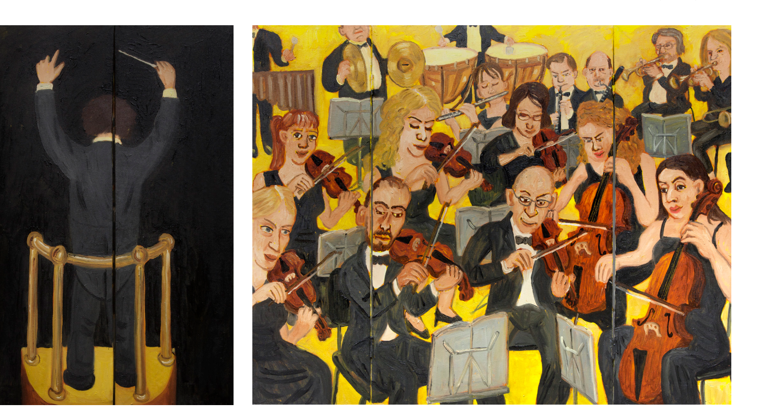
Orchestra, 2014, Oil on canvas, closed: 30 1/8 x 19 1/8 in, open: 30 1/8 x 37 1/2 in

newyork@flowersgallery.com www.flowersgallery.com