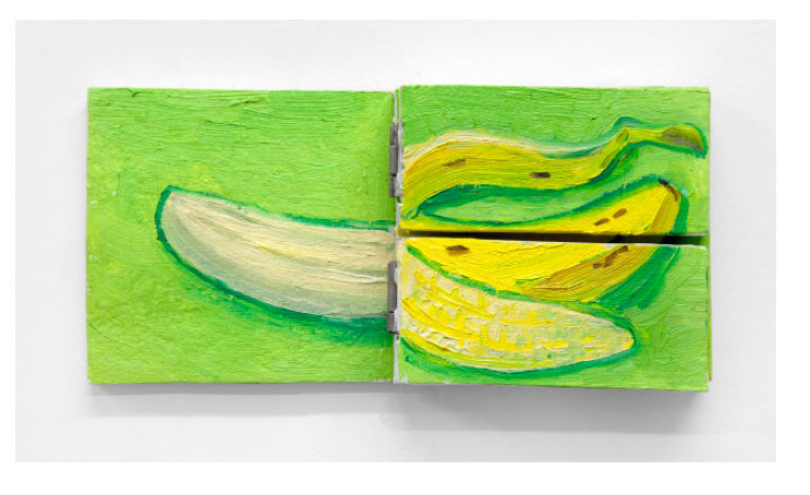
Banana, 2014, Oil on board, 43/8 x 87/8 in