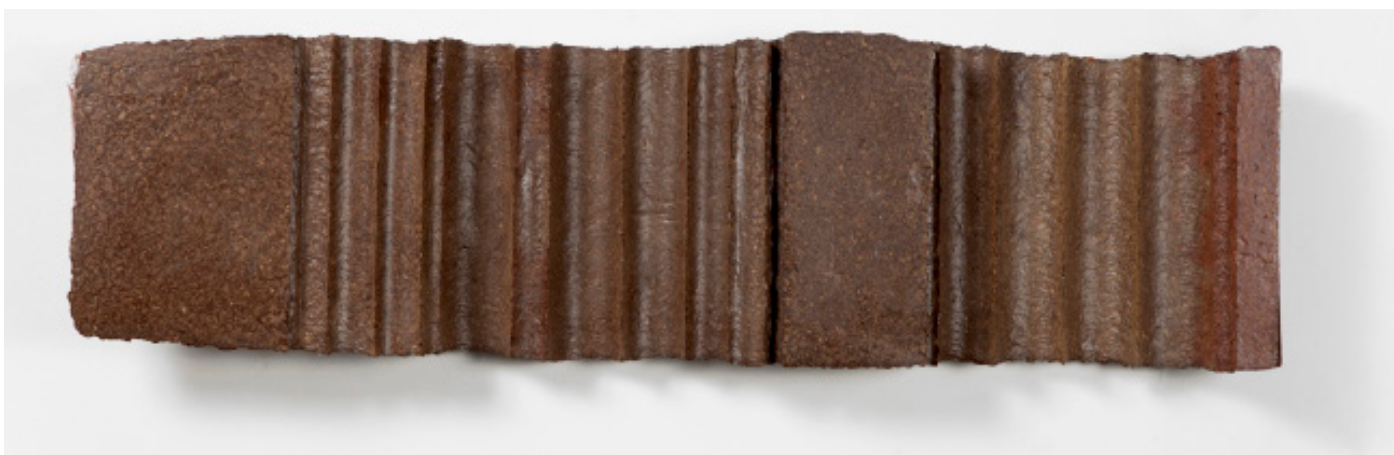
Off The Wall - Burnt Umber , 1998, Cellulose Fibre with Iron Powder