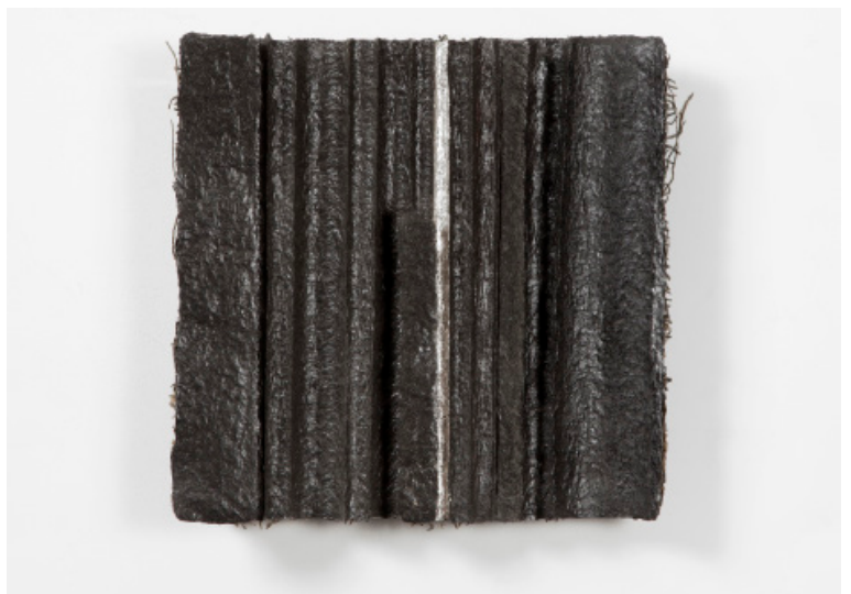
Memento V , 2002, Cellulose Fibre with Graphite and Palladium Leaf