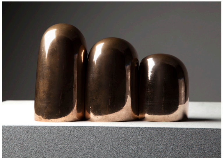
Arches , 1977, Bronze

her process of casting from negative moulds in her sculptural works allows the form to reveal itself over time, throughout the long gestational period of its construction, and in the small chance details disclosed in the final unwrapping.