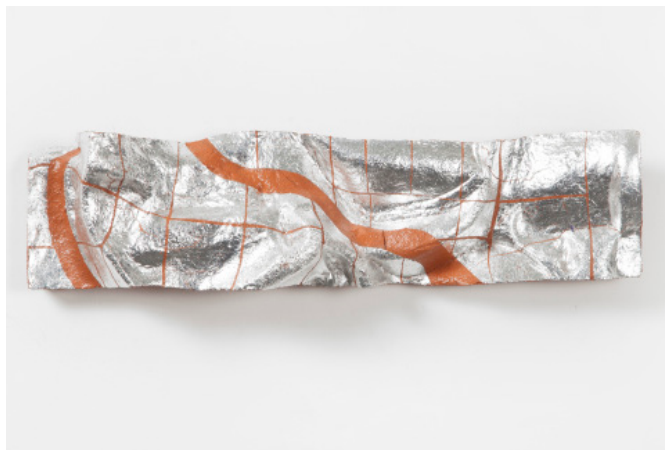
Horizontal V , 2003, Ceramic with Aluminium Leaf