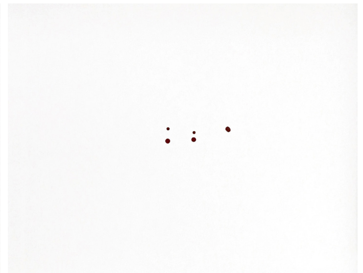
Lotus , 2014, Acrylic on Archival Pigment Print, Diptych, each panel 17 x 22 in