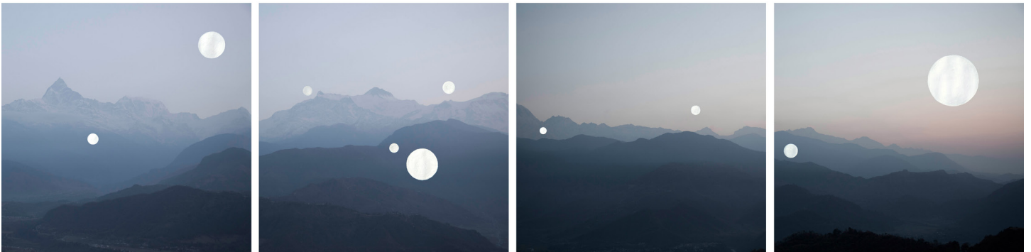
Sarangkot , 2014, Acrylic on Archival Pigment Print, Quadtych, each panel 16.5 x 23.4 in

For further information and images please contact Brent Beamon on brent@flowersgallery.com or 212 439 1700.