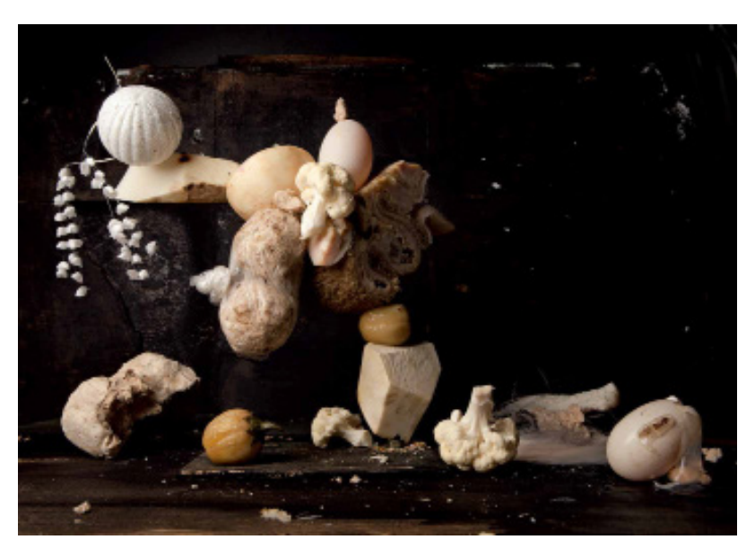
Creamy Dalston Stuff, 2013