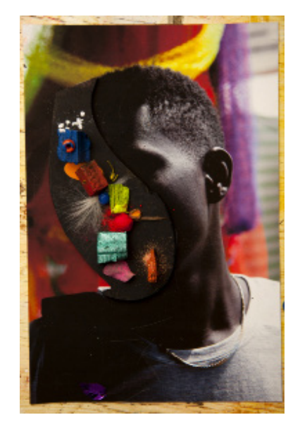
Multicolour #1, 2013