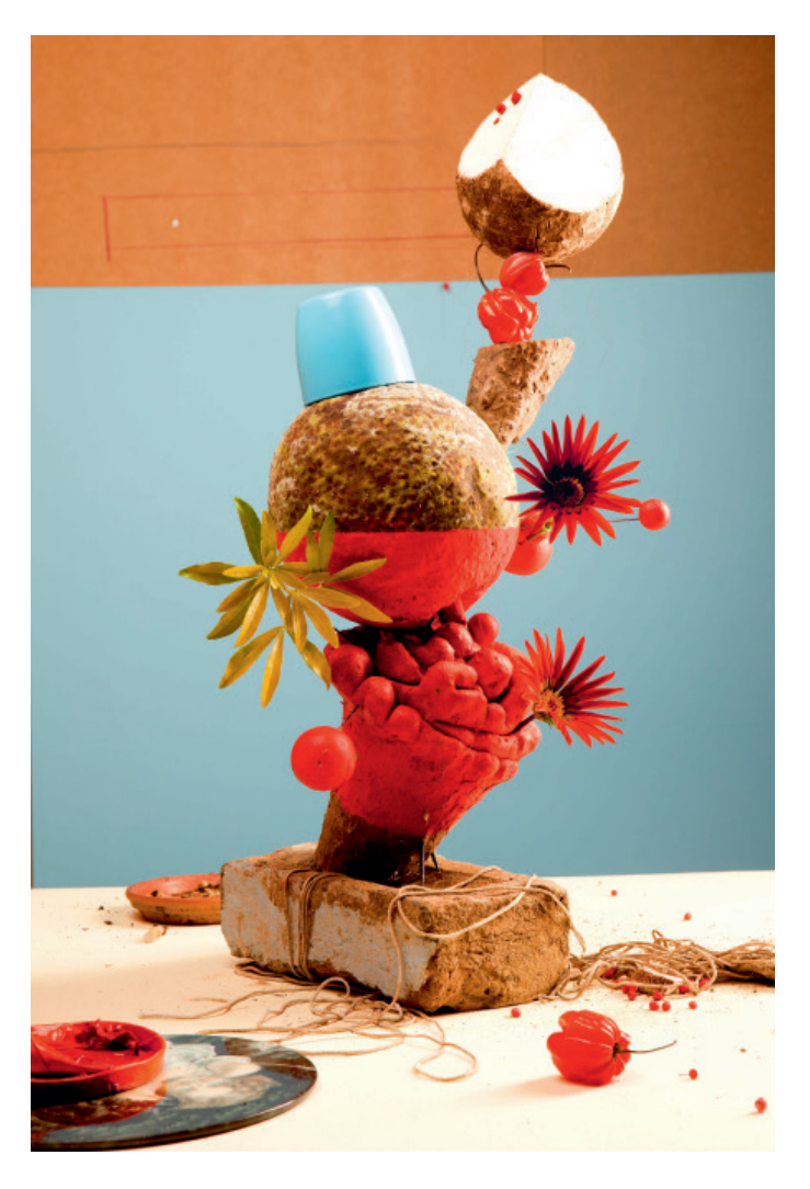
Red Stripe, 2013

Lorenzo Vitturi's project Dalston Anatomy examines the environment of East London's Ridley Road Market through a series of portraits and still life photographs. Vibrant and energetic, the distinctive nature of the place is depicted through the faces of local characters, urban setting and debris from the market.