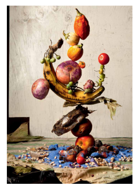
Green Stripes #1, 2013

For further information and images please contact Alex Peake on Alex@flowersgallery.com or 0207 920 7777