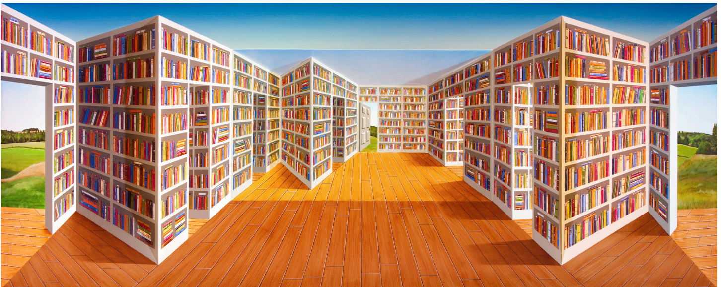
Going Into Reverse , 2014, Oil on board construction, 26 3/4 x 67 7/8 x 9 7/8 in

For further information and images please contact Brent Beamon on brent@flowersgallery.com or 212 439 1700.