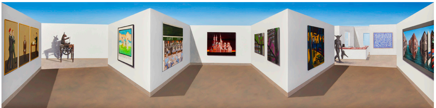
New York Flowers , 2014, Oil on board construction, 22 7/8 x 91 3/4 x 9 1/4 in