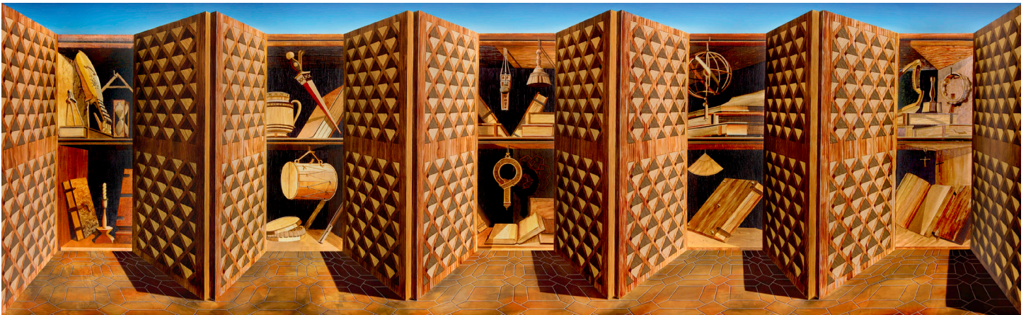
A Study Of The Studiolo , 2013, Oil on board construction, 31 1/2 x 102 3/8 x 8 5/8 in

Flowers is pleased to announce Studiolospective , an exhibition of new paintings by the renowned British surrealist Patrick Hughes. The show will run from May 1 through June 14 with an opening reception for the artist on Thursday, May 1, from 6 to 8pm.