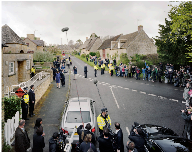
David Cameron, Conservative, Spelsbury, 6th May 2010 (Witney constituency)