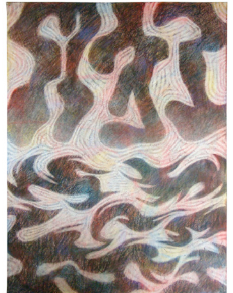
Murakami 2012 Pastel on paper 61 x 46 cm