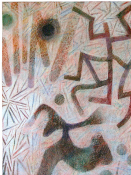
Shapeshifter 2012 Pastel on paper 61 x 46cm