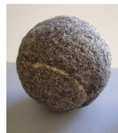
The Middle Years , 2010 Shaved tennis ball covered in artist's own hair