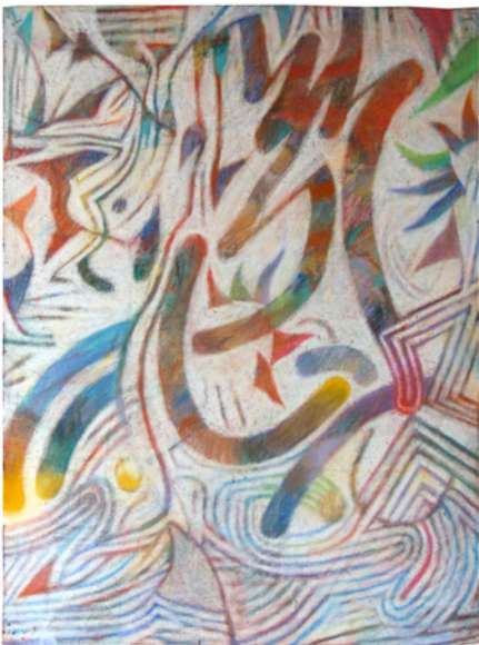
Glad Day 2012 Pastel on paper 61 x 46 cm