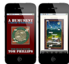
A Humument iPhone app