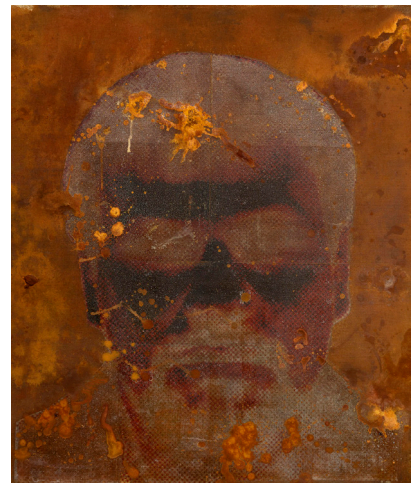
left: Face , 2019, oil on linen. Right, from top: Новичок (Novichok) 1 , 2019, reactive metallic paint and inkjet transfer on linen; Новичок (Novichok) 3 , 2019, reactive metallic paint and inkjet transfer on linen.

All images (c) John Keane, Courtesy of Flowers Gallery