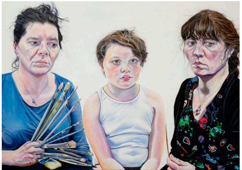
Two Painters , 2019, oil on canvas, 85 x 120 cm