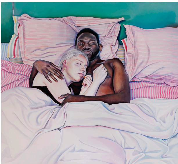
Clockwise from top left: Fraser Asleep , 2018, oil on board, 13 x 18 cm; Me. Eyes Clenched Grief - Tears , 2018, oil on board, 15 x 20 cm; Lily and Quaye , 2019, oil on canvas, 127 x 116.8 cm; Bed , 2019, oil on canvas, 100 x 180 cm.