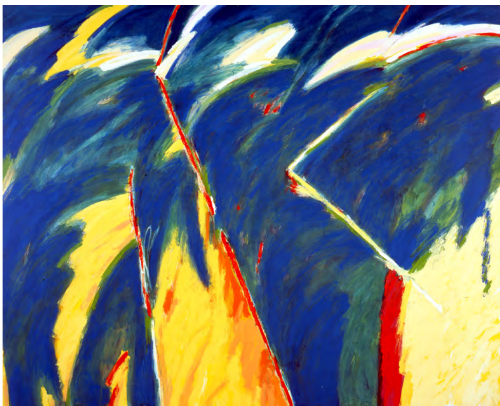
From left: Jack Smith, Rise and Fall . Light and Sound 2 , 1984, oil on canvas; Prunella Clough, Undone , 1994, oil on canvas; William Crozier, Watermeadows , 1977, oil on canvas.