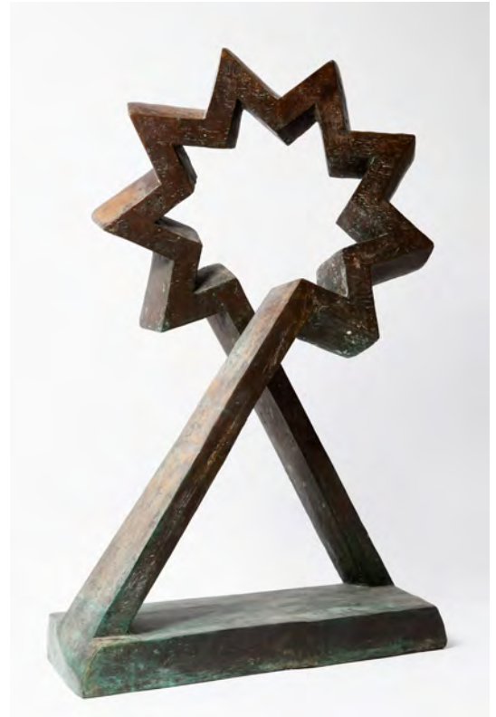
Paul Neagu, Starhead Figure, Bronze, 116 x 75 x 25 cm, (c) The Estate of Paul Neagu

To coincide, an exhibition of contemporary work produced by represented artists takes place at the London Kingsland Road gallery from 11 February. The exhibition 50 x 50 includes 50 works by 50 represented artists, at 50 x 50cm. For more information please click here .