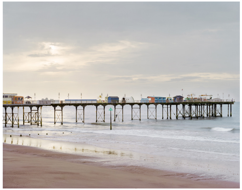
Teignmouth Grand Pier, Devon, July 2011, Fujicolour Crystal Archive Print, 122 x 152 cm / 48 x 60 inch