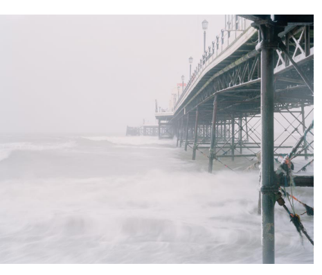
Boscombe Pier, Dorset, 2011 Southwold Pier, Suffolk 2012 Worthing Pier, West Sussex, 2013