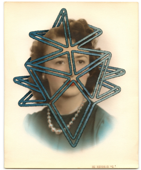
Donna , 2014, Hand embroidery on found photograph, 25.4cm x 20.3cm