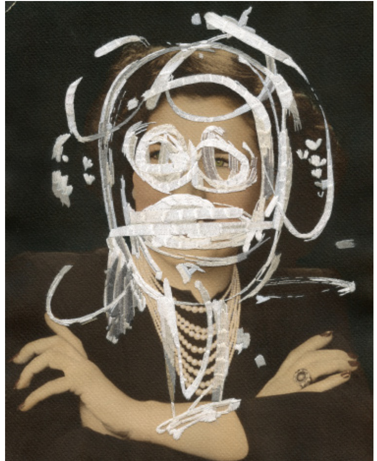
Contemplation , 2014, Hand embroidery on found photograph

Removing each image from its original context, Cockburn opens up new possibilities of narrative interpretation about the lives of the anonymous sitter. As she describes: "It is the same process as sitting in the waiting room, making up stories about the strangers in the room." Waiting Room can be interpreted as a metaphor for an internalized space of contemplation. Cockburn invites us to linger and engage in playful curiosity about our everyday interactions with the unfamiliar.