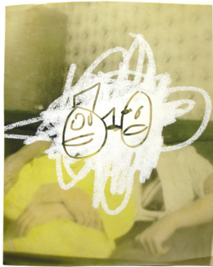
The Disagreement , 2013, Acrylic on giclee print on Hahnemuhle German Etching, 97.5cm x 80.5cm