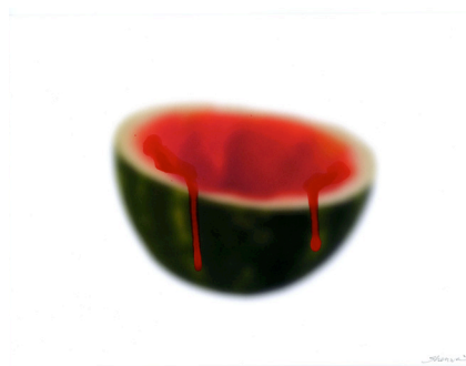
Shen Wei, Untitled (Watermelon) , 2014, Acrylic on archival pigment print, 6 x 8 in