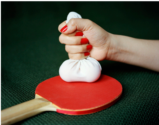
Pixy Yijun Liao, Ping Pong Balls , 2013, Digital C print, 5 x 7 in

For further information, please contact Brent Beamon - Brent@flowersgallery.com / 212 439 1700.