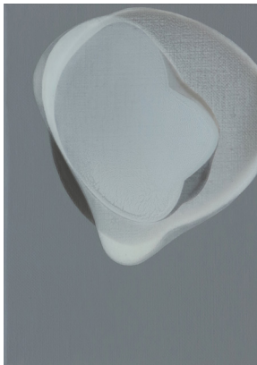
Sooyeon Hong, Invisible Hands , 2014, Acrylic on linen, 8 3/4 x 6 1/4 in