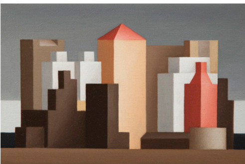
Renny Tait, American Cityscape , 2014 Oil on canvas, 6 x 9 in