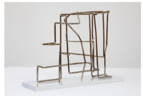
Jeff Lowe, Phoenix , 2014, Nickel coated steel, 8 5/8 x 6 3/4 x 2 in