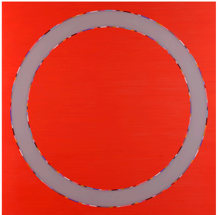
Circular Stories - Passing, 2013, oil on canvas, 213.5 x 213.5cm