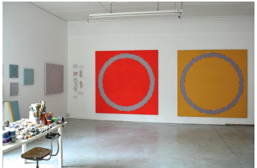
Artist's Studio , 2014