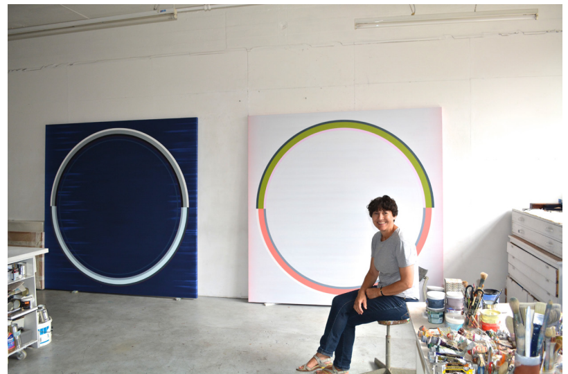
Artist's Studio , 2014