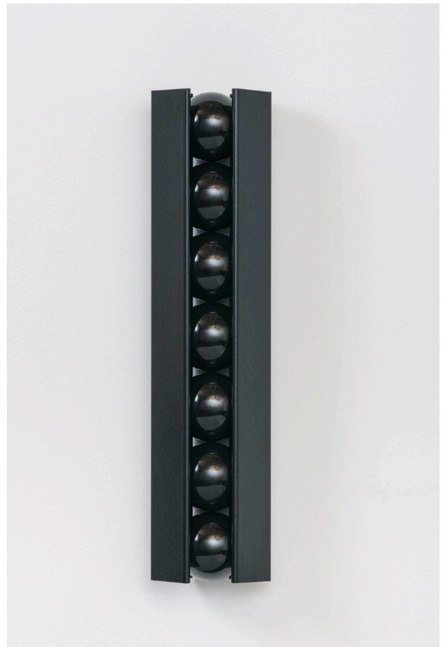
Cedric Christie, Black Crayon , 2015, Stove enamelled stainless steel, 40 x 40 x 5 cm

For his fourth solo exhibition at Flowers Gallery, Cedric Christie presents a new series of sculptures and works on paper, expanding his ongoing negotiation of the boundaries between painting and sculpture, and the formal interactions of colour, shape and surface.