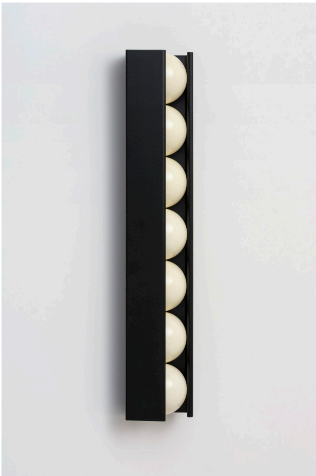
Cedric Christie, Black and White , 2015, Stove enamelled stainless steel, 40 x 40 x 5 cm

info@flowersgallery.com www.flowersgallery.com