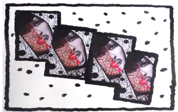
Film Still from Sometimes I Feel Like That , 2014, Digital Film