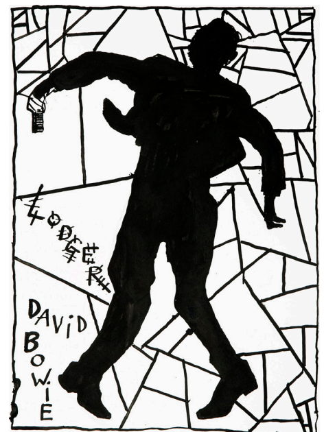
Drawing for David Bowie's Lodger LP I, 1979, Mixed Media