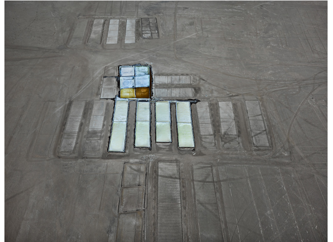
Salt Pans #10, Little Rann of Kutch, India, 2016