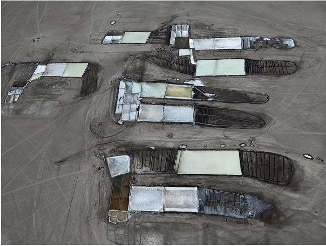
Salt Pans #25, Little Rann of Kutch, India, 2016