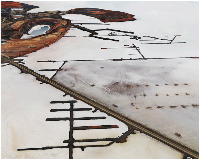
Silver Lake Operations #16, Lake Lefroy, Western Australia, 2007