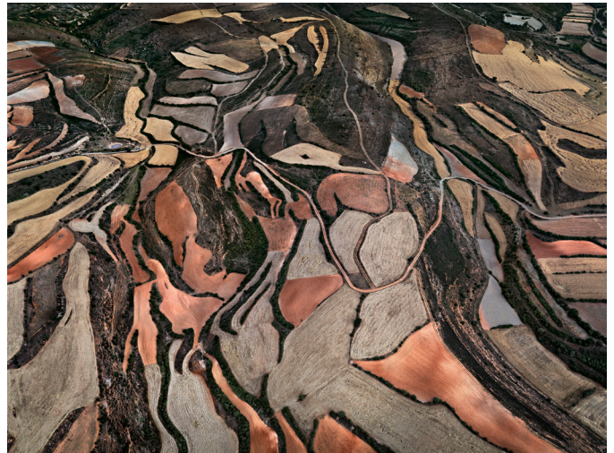
Dryland Farming #24, Monegros County, Aragon, Spain, 2010