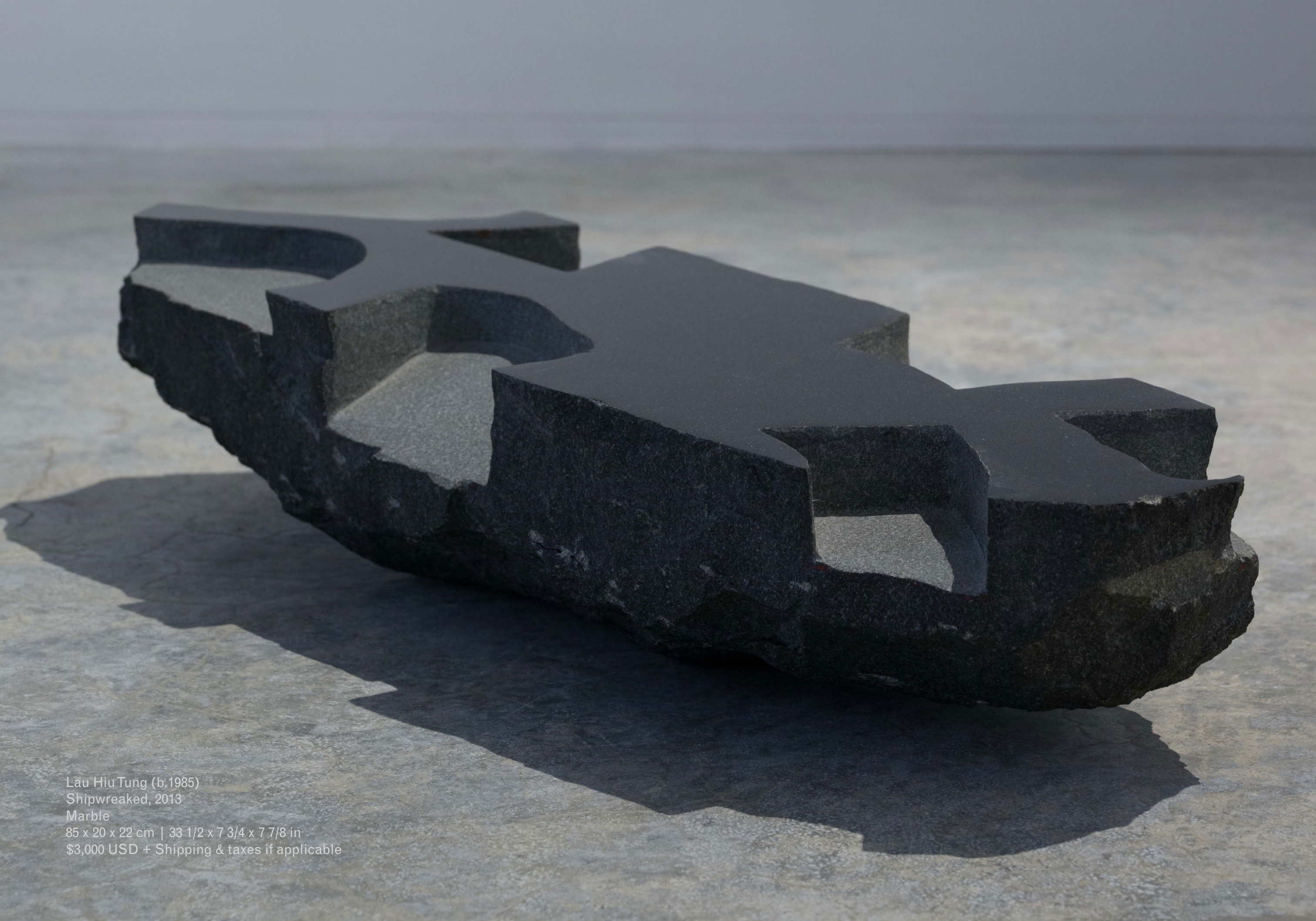
Lau Hiu Tung (b.1985) Shipwrecked, 2013 Marble 85 x 20 x 22 cm | 33 1/2 x 7 3/4 x 7 7/8 in $3,000 USD + Shipping & taxes if applicable