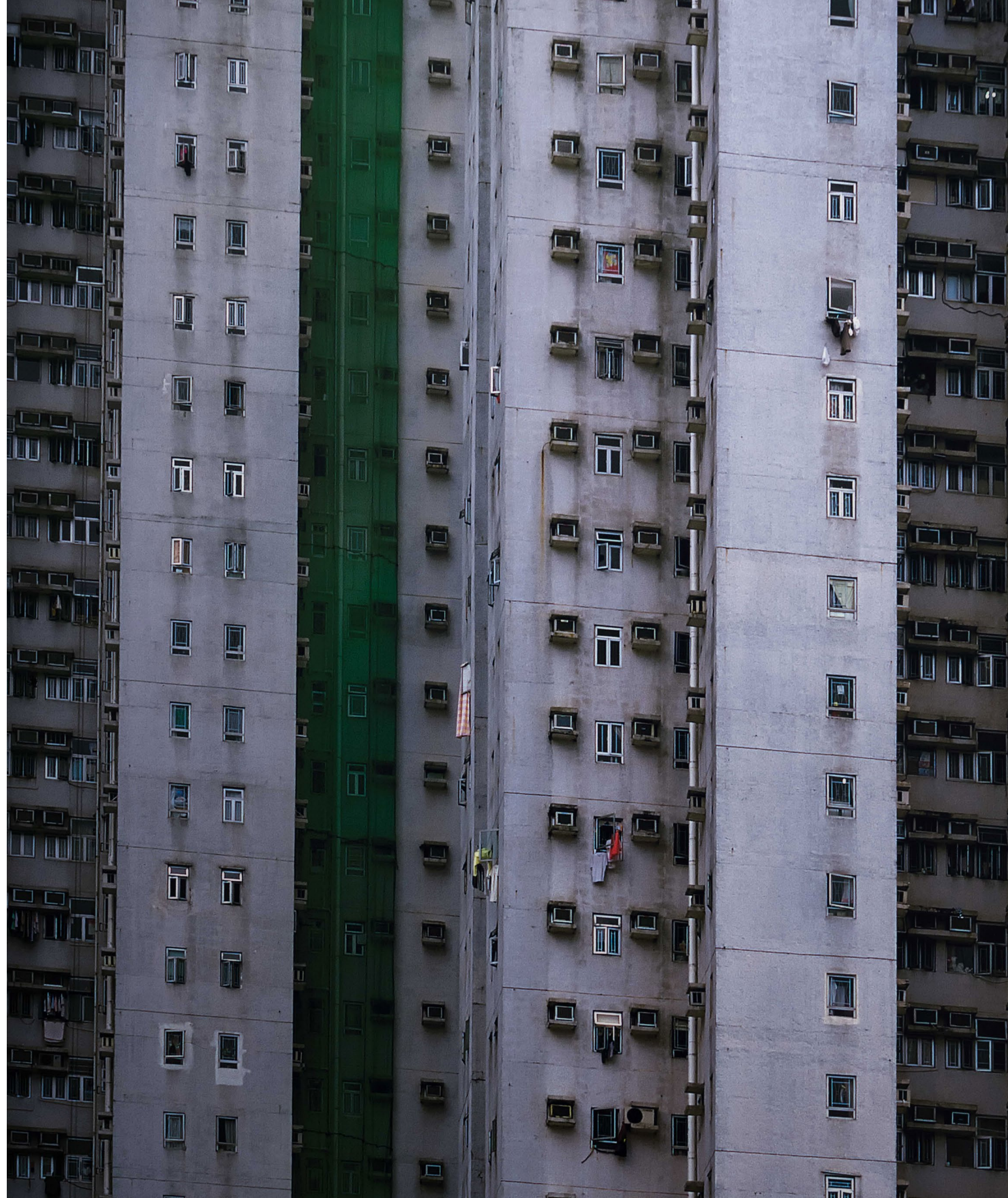
Architecture of Density #13b, 2009 (Detail)