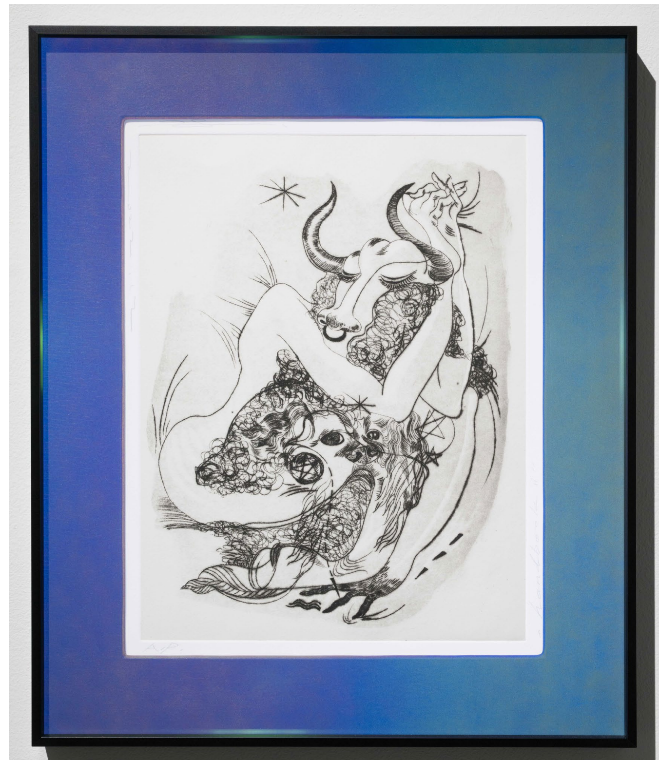
Wu Jiaru (b.1992) „handbook ii“, 2022 Drypoint 40 x 30 cm | 15 3/4 x 11 3/4 in Edition 1 of 3 $2,900 USD + Shipping & taxes if applicable