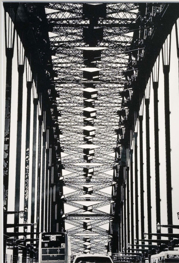
Rod Taylor (b.1937) Crossing a bridge, Sydney Archival print of Baryta paper 45 x 35 cm | 17 3/4 x 11 7/8 in Edition 1 of 8 $1,000 USD + Shipping & taxes if applicable