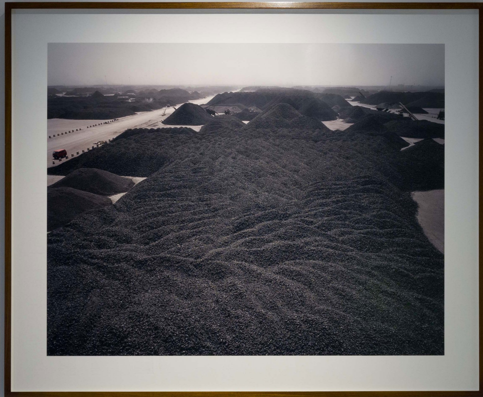
Edward Burtynsky (b.1955) Tanggu Port, Tianjin, China, 2005 Chromogenic Colour Print 99 x 124.4 cm | 39 x 49 in Edition 6 of 9 $26,000 USD + Shipping & taxes if applicable