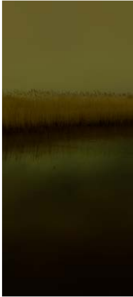
From left: Horizons I , (Coalhouse Fort towards St Mary Hoo), England, 2015; Water XI , (Mucking towards Stanford Le Hope), England, 2017

In the production of Dark Line , Kander's slower method of working has mirrored the pace of the river, developing a reductive abstract language to replace the ultra-realism of photography.