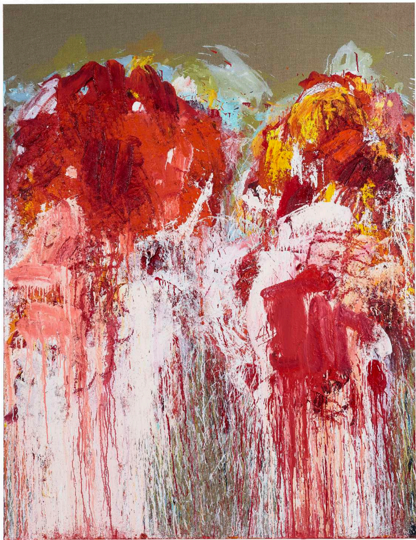
Chartres, 2023 Oil on Belgian linen 200 x 153 cm 78 3/4 x 60 1/4 in