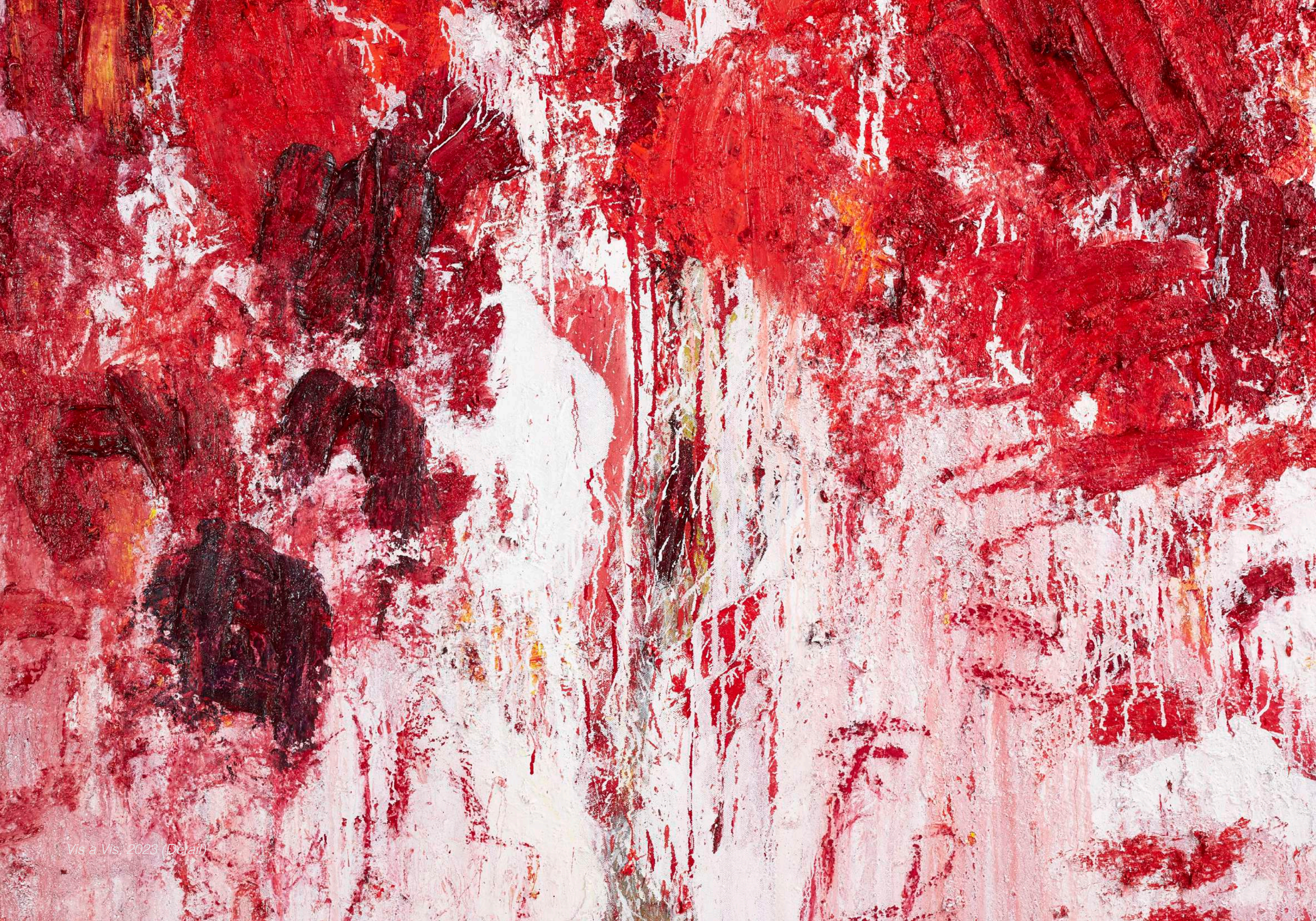
Vis a Vis, 2023 (Detail)