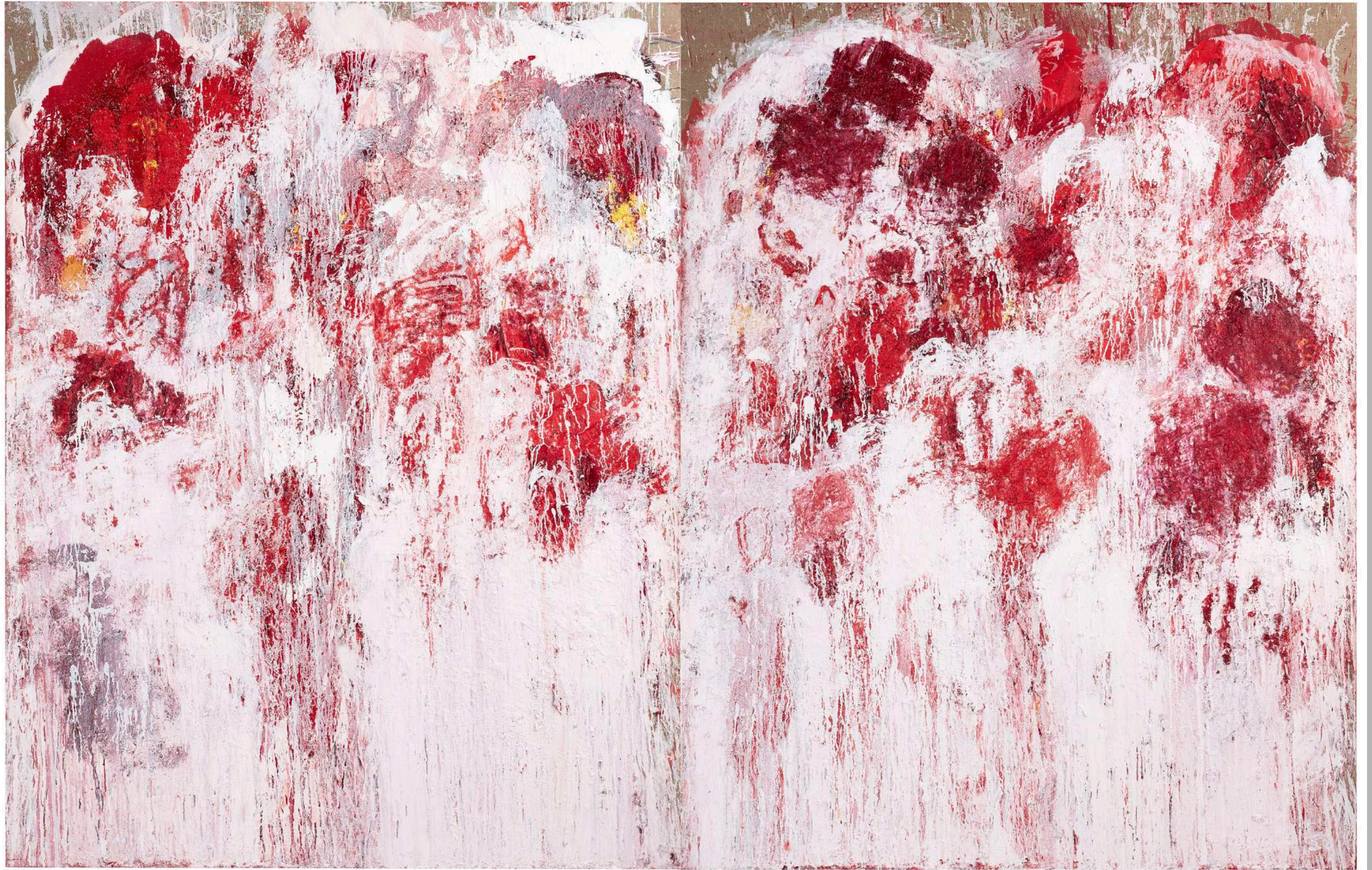
With the crimson word I , 2023 Oil on Belgian linen 206 x 320 cm | 81 1/8 x 126 in