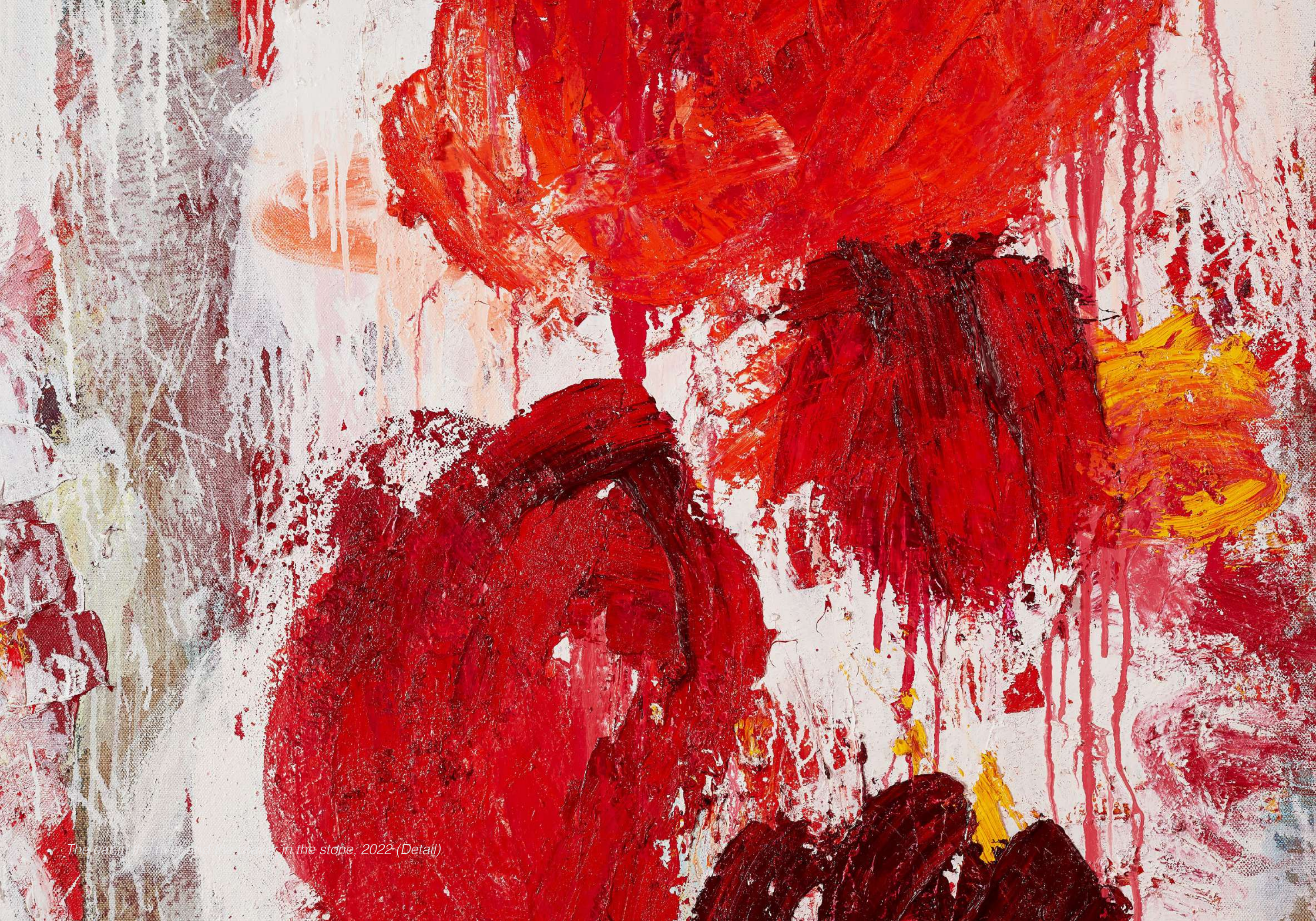
The earth, the fire, the stone in the stone, 2022 (Detail)