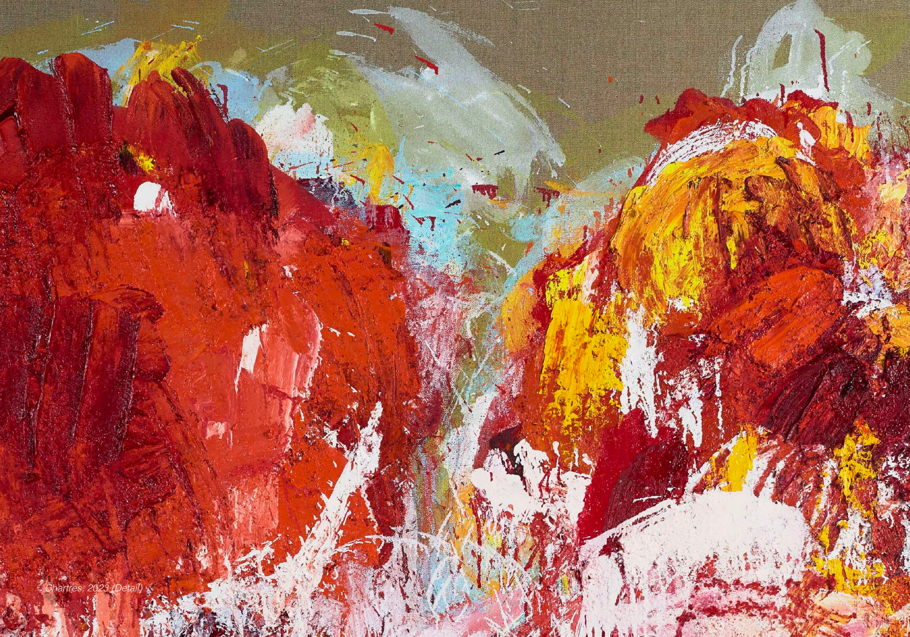
Chartres, 2023 (Detail)