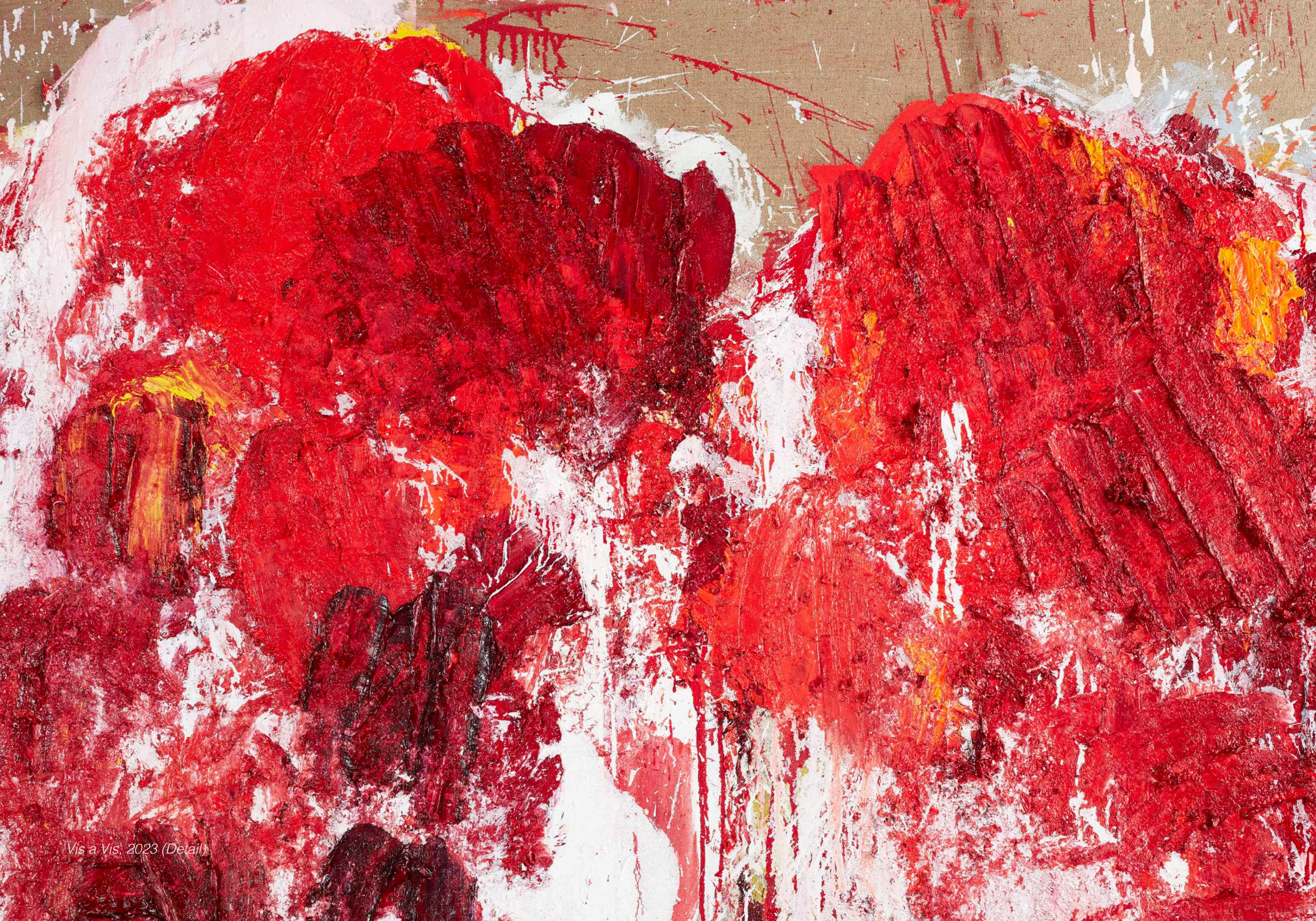
Vis a Vis, 2023 (Detail)