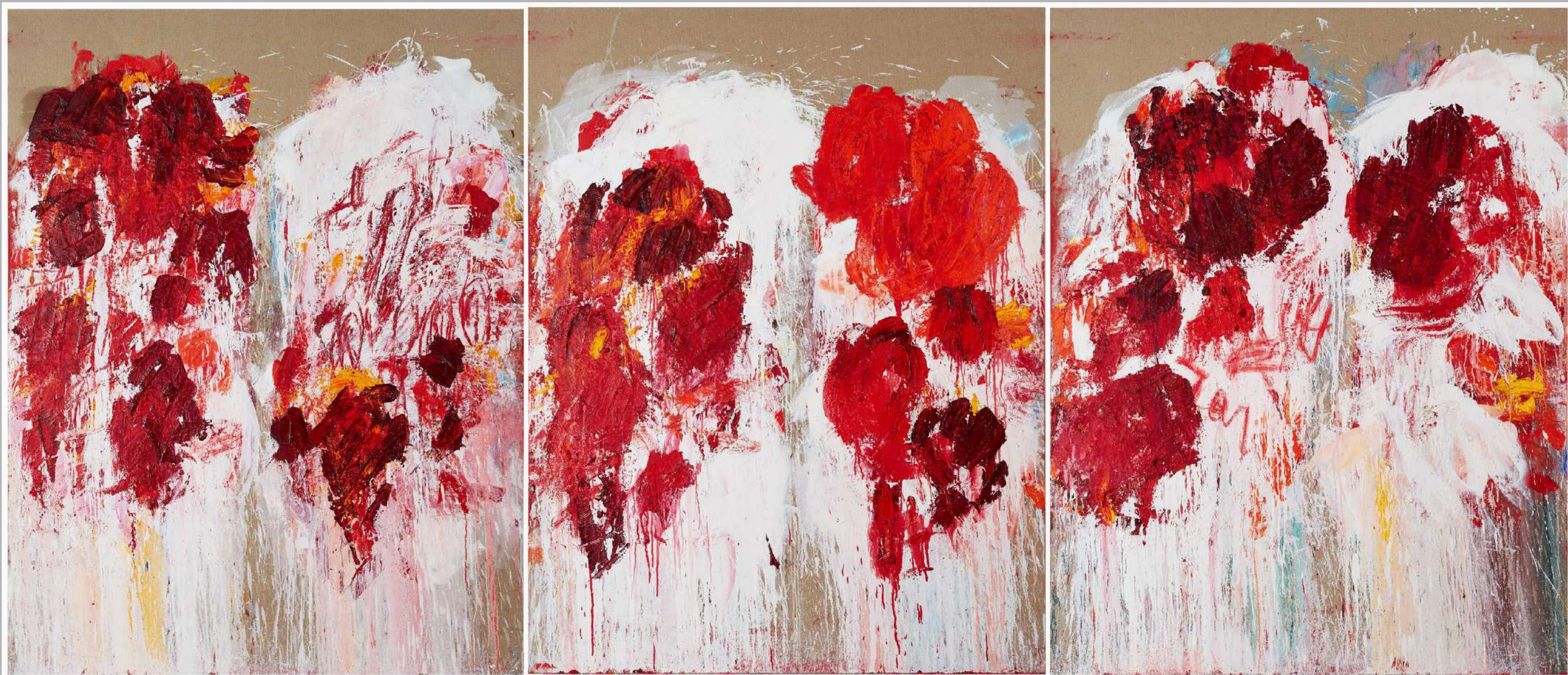
The ear in the river and the prayer in the stone, 2022