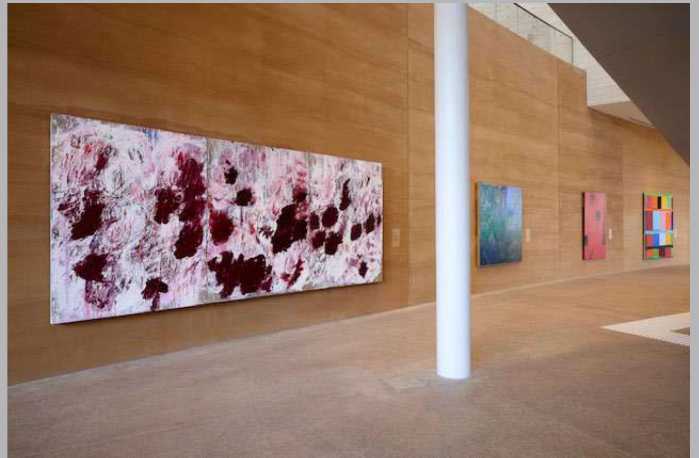
Sewn onto stones in the sky, 2019 displaying at Art Gallery of New South Wales, 2022-23, The Sydney Modern opening

Allen, Allen and Hemsley Art Gallery of New South Wales, Sydney Art Gallery of South Australia, Adelaide Auckland Art Gallery, New Zealand Australian National University, Canberra Albury Regional Gallery Allens Arthur Robinson, Sydney Artbank Ballarat Fine Art Gallery, Victoria The British Museum, London Campbelltown City Art Gallery, Sydney The Chartwell Collection, New Zealand Curtin University Collection Perth The Derwent Collection, Tasmania The Esk Collection, Tasmania The Federal Law Courts of Australia Geelong Art Gallery, Victoria Heide Museum of Modern Art, Melbourne Holmes à Court Collection, Perth The IBM Australia Collection La Trobe University Art Museum, Melbourne The Macquarie Group Collection, Sydney Mallesons Stephen Jacques, Melbourne Monash University Museum of Art, Melbourne Mornington Peninsula Regional Gallery, Victoria Myer Art Foundation, Melbourne National Gallery of Australia, Canberra National Gallery of Victoria, Melbourne Newcastle Region Art Gallery, New South Wales New England Regional Art Museum, New South Wales Orange Regional Gallery, Orange Queensland Art Gallery, Brisbane Queensland University of Technology, Brisbane TarraWarra Museum of Art, Victoria Toowoomba Regional Gallery, Queensland University of New South Wales, Sydney University of Sydney, New South Wales University of Queensland Art Museum, Brisbane University of Western Sydney, New South Wales Wagga Wagga City Art Gallery, New South Wales Westpac Collection, New York