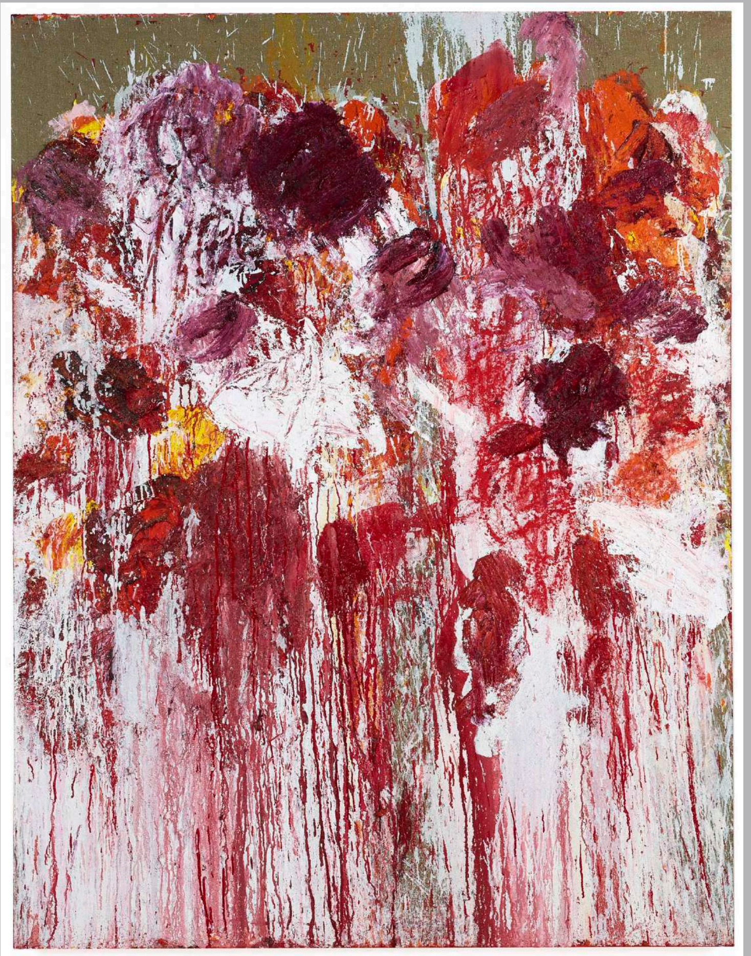
With the crimson word II, 2023 Oil on Belgian linen 200 x 153 cm 78 3/4 x 60 1/4 in