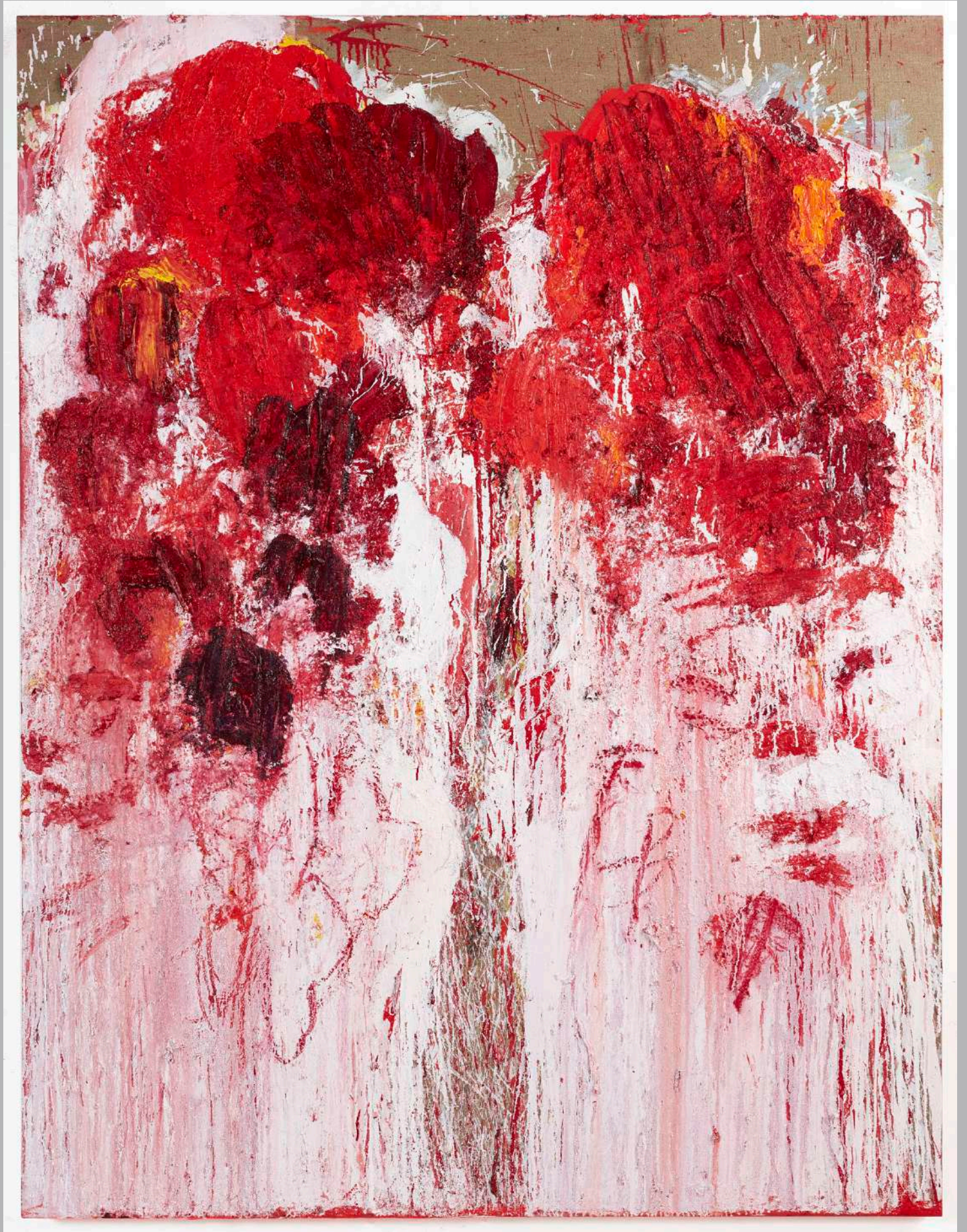
Vis a Vis, 2023 Oil on Belgian linen 200 x 153 cm 78 3/4 x 60 1/4 in