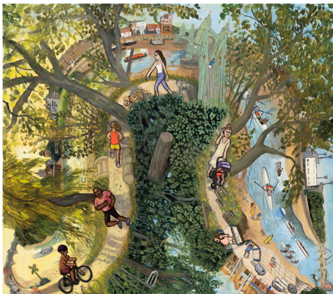
Captions from top: The River, 6. Blackfriars Bridge to Tower Bridge , 2019, oil on canvas, 44 x 242 cm; The River, 2. Barnes Bridge to Putney Bridge , 2019, oil on canvas, 104 x 118 cm