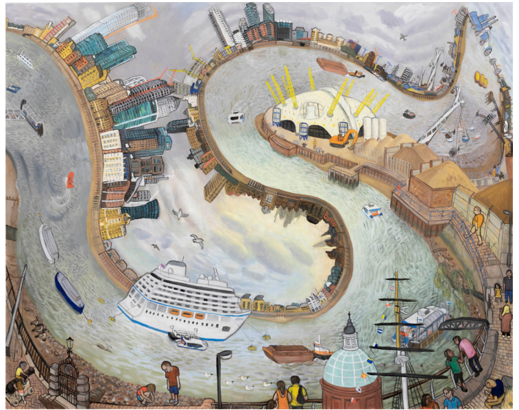
The River, 8. Canary Wharf to the Thames Barrier, 2019, oil on canvas, 130 x 162 cm