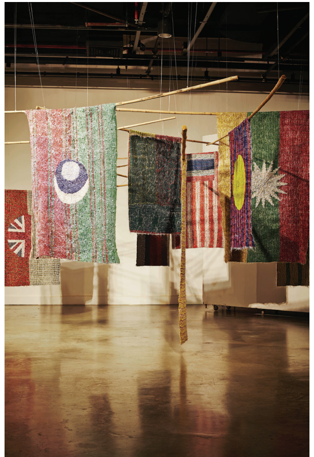
Jakkai Siributr, The Outlaw's Flag (2017), mixed media flag and video installation, single channel HD video, colour, 7:52 mins, videography: Shane Bunnang, photography: Smit Na Nakornpanom

A retrospective exhibition is planned for CHAT (Centre for Heritage, Arts and Textile, Hong Kong) in November 2023.