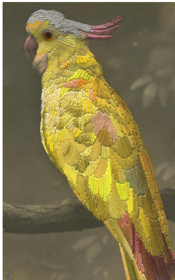
Julie Cockburn, Yellow Parrot , 2023, hand embroidery and ink on found postcard, 13.2 x 8.4 cm

press@flowersgallery.com www.flowersgallery.com