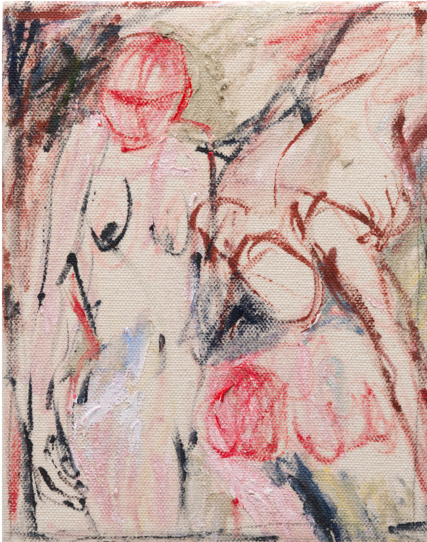
Kim Booker, Tempest , 2023, Oil, graphite and charcoal on canvas, 20 x 15cm